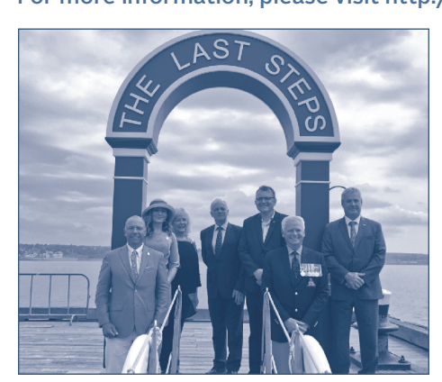
It was an honour to represent Halifax on behalf of Mayor and Council at the unveiling of the interpretive plaque at the Last Steps WWI memorial on the Halifax Waterfront

For more information, please visit http://halifaxsouth.ca/pb.