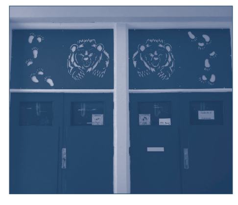
You'll see changes around Gorsebrook JHS, some of which have been paid for in part by Participatory Budgeting. These "jack-o-lantern" windows on the gym are the newest improvements.