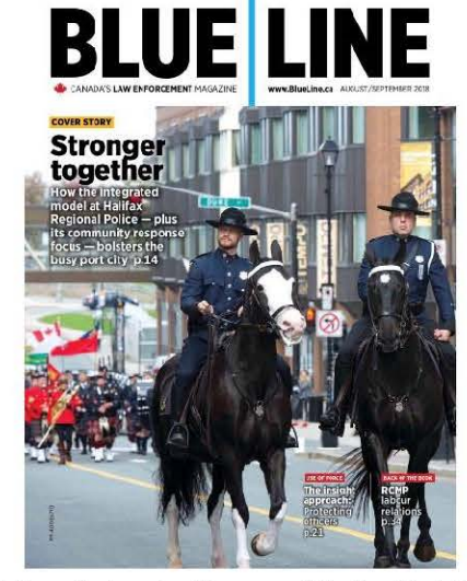
HRP was featured on the cover of the Aug/Sept Blue Line magazine (above). HRP officers provided site security at the CACP conference (below).

HRP was proud to co-host, along with RCMP Halifax District & Canadian Forces Military Police, the 113<sup>th</sup> Canadian Association of Chief's of Police Annual Conference in Halifax last month.