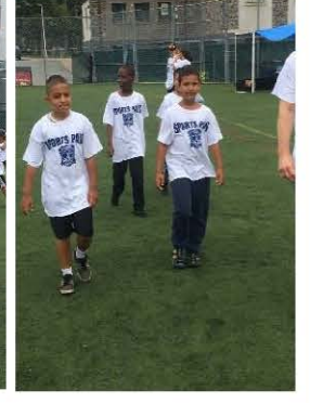
HRP officers taught soccer skills and drills to youth on Wickwire Field at Dalhousie University on July 31.