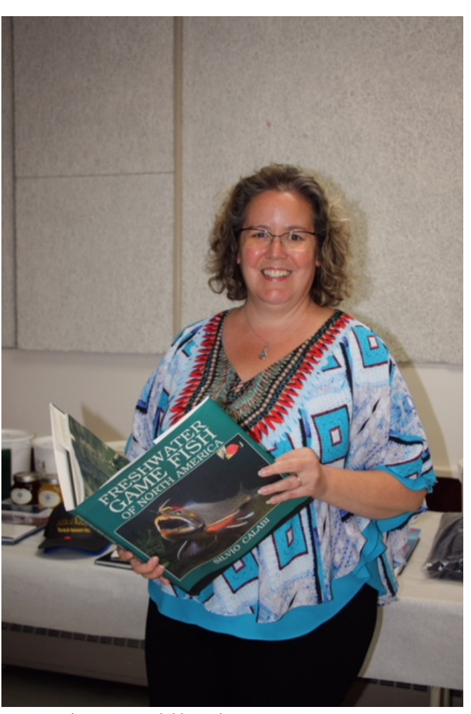
Perusing the items available at the Penny Auction