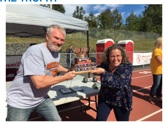
The fight for football supremacy between Sackville High and Millwood High