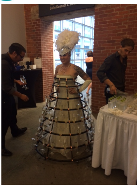
Champagne Dress at the Lady Ball – ovarian cancer fundraiser