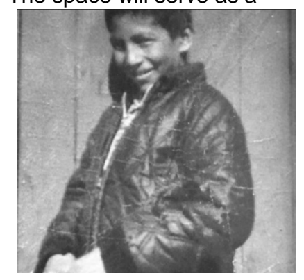
Figure 1 Chanie Wenjack - whose death sparked the first inquest into the treatment of Indigenous children in Canadian residential schools.

symbol and reminder for Halifax Regional Council of the important work around reconciliation.