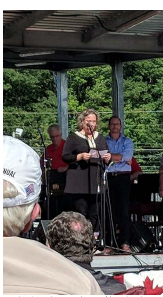
I was pleased to speak at the grand opening of the Acadia Park Band Stand