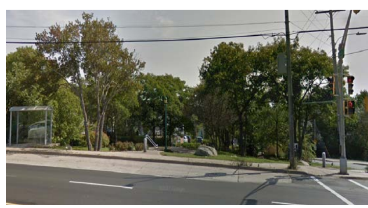
Williams Lake Road Pocket Park

Bring the family and come out for an evening of festive fun!