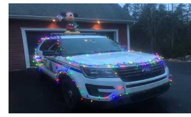
Lower Sackville Car 23 decked out for the Beaverbank Xmas Parade with a Special Guest.