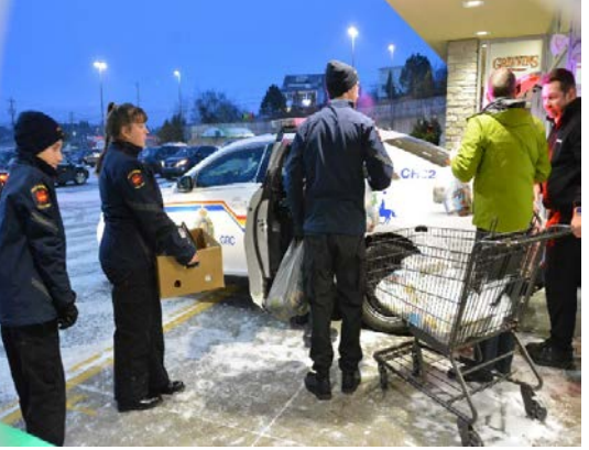
Stetsons & Spurs Youth Group in Cole Harbour in partnership with Sobey's Panavista, Hot Country 103.5 and Rock 105.1, held the 3rd annual Stuff a Cruiser for the Cole Harbour Food Bank.