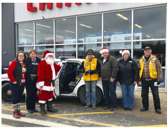
Hubbards Lions Club and the Upper Tantallon Canadian Tire store, held their annual Stuff the Cruiser Toy Drive on Saturday November 24th.