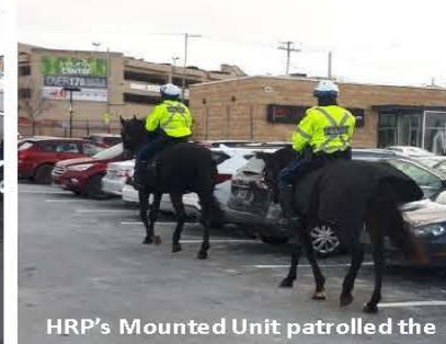
West End on Black Friday.

HRP's mascot, Blue , and Halifax Search & Rescue's mascot, Sammle the Search Dog, attended the Spryfield Santa Claus Parade.