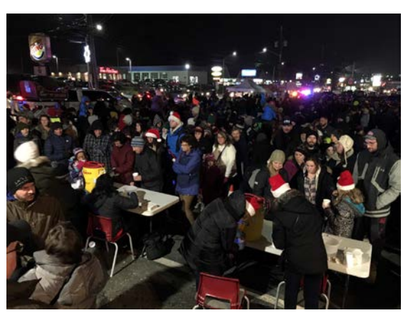
Community enjoying the Sackville Tree Lighting festivities!