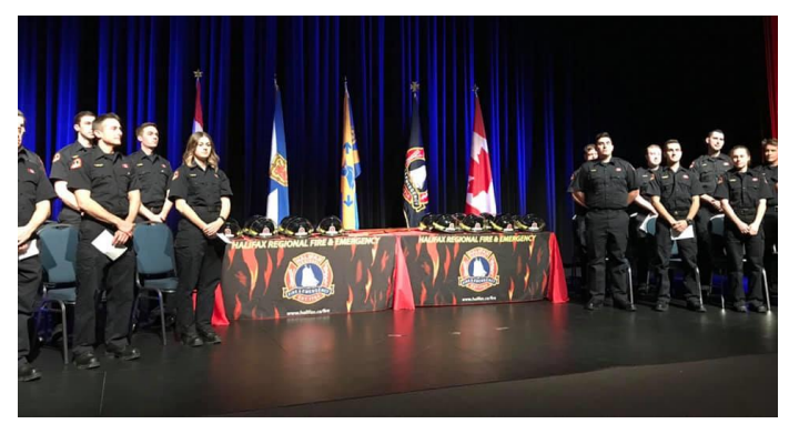
Volunteer Fire Fighter Induction Ceremony