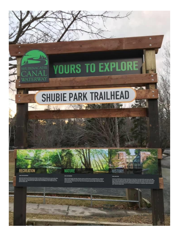
New signage at Shubie Park