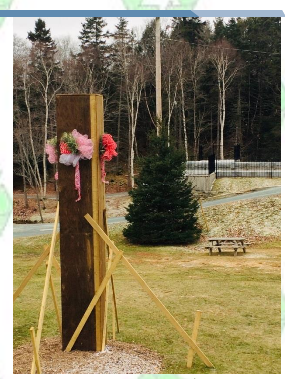
Shubie Park Palm Tree under wraps for the winter

This recommendation is expected to come before Regional Council this month for deliberation.