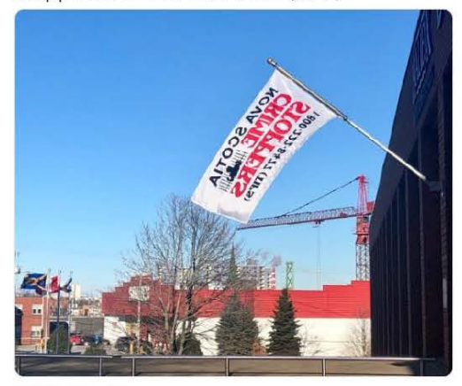
11:46 AM - 15 Jan 2019

January is Crime Stoppers Month. The month brings awareness and public support to the national program that contributes to solving crime. HRP is flying the @NSCrimeStoppers pennant at police HQ. Have a tip? Call Crime Stoppers at 1-800-222-8477 (TIPS).