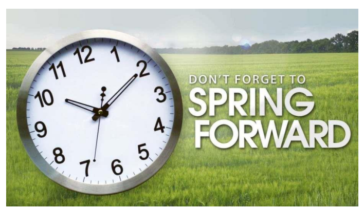
Don't forget Sunday March 10<sup>th</sup> marks the beginning of Daylight Saving Time - turning the clocks one hour forward. Happy Spring Everyone!

trained to track lost people, detect illegal drugs and apprehend fleeing suspects on command. Thanks to each member of the K-9 Unit for their ongoing dedication and commitment to protecting and serving. A special thanks to the handlers for showing such care and pride for their dogs.