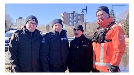
Ice Safety training on Lake Banook

A detailed land use policy, including finalizing the rules that will guide the design and use of buildings in the Cogswell District, will be reviewed and considered in the coming months as part of the Municipal Planning Strategy (MPS) and Land Use By-law (LUB) amendment process. The goal is to complete the process well in advance of the sale of the first development block. To learn more about the design plan and next steps, visit our <u>website</u> or <u>read the staff report</u>.