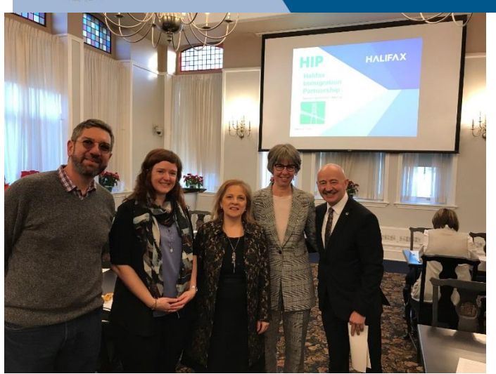
Local Immigration Partnership Stakeholders Meeting