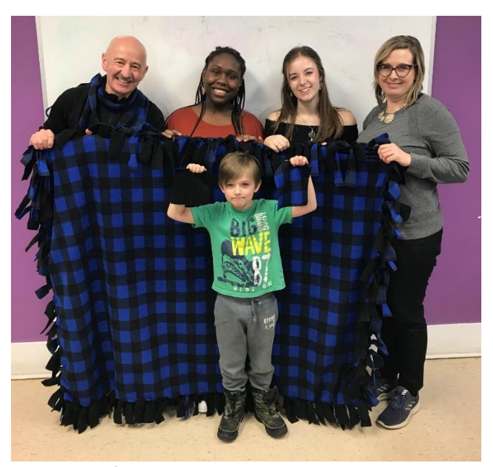
Project Comfort blanket making with some exceptional community members

Regional Council will be doing our final review of the 2019/20 Municipal Operating and Capital Budget at the April 2<sup>nd</sup> meeting of Regional Council. <u>Tune in online</u> or attend the session at City Hall, 1841 Argyle Street.