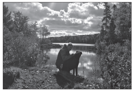
Hiking with my family in the Purcell's Cove Backlands. Halifax is working with the Nature Conservancy of Canada and the Shaw Group to protect these lands and create an urban wilderness park.