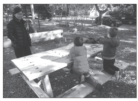
Great to see the new picnic tables at Sir Charles Tupper school being put to use. A project supported by District 9 Capital Funds