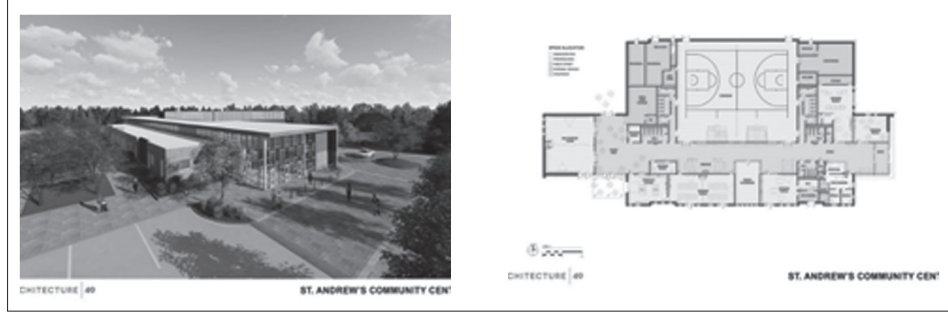
Figure 1 Architectural rendering of proposed St. Andrew's Community Centre.

Although delayed by a few months due to the requirement to complete an archeological survey of the site, the tender for demolition of the existing building will be available on the Nova Scotia Tender (procurement) office in December. Demolition of the existing