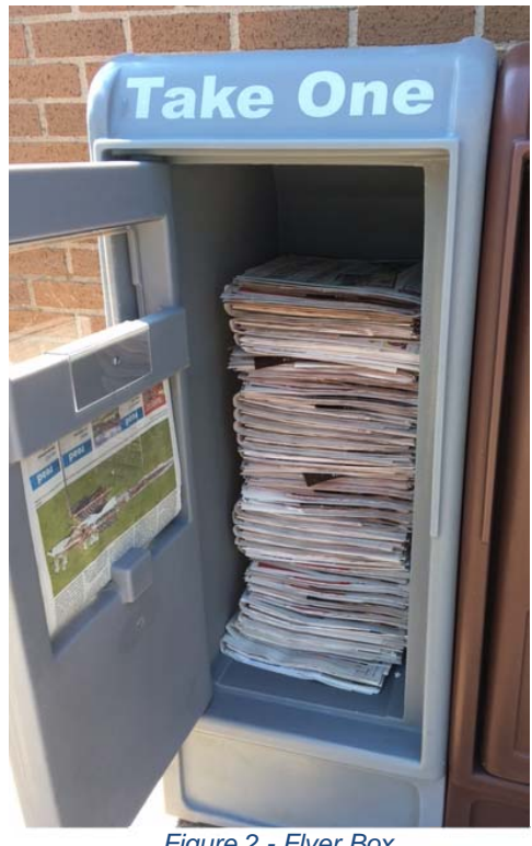
Figure 2 - Flyer Box

The Herald reports feedback to date has been positive. As the project progresses, surveys will be conducted by an independent contractor to further evaluate.