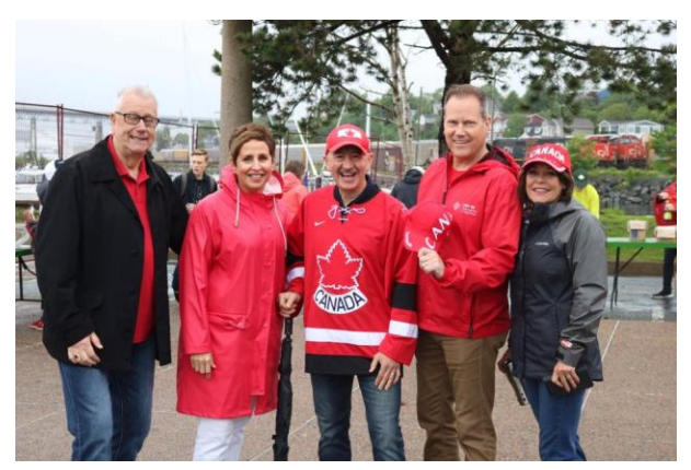
Happy Canada Day!