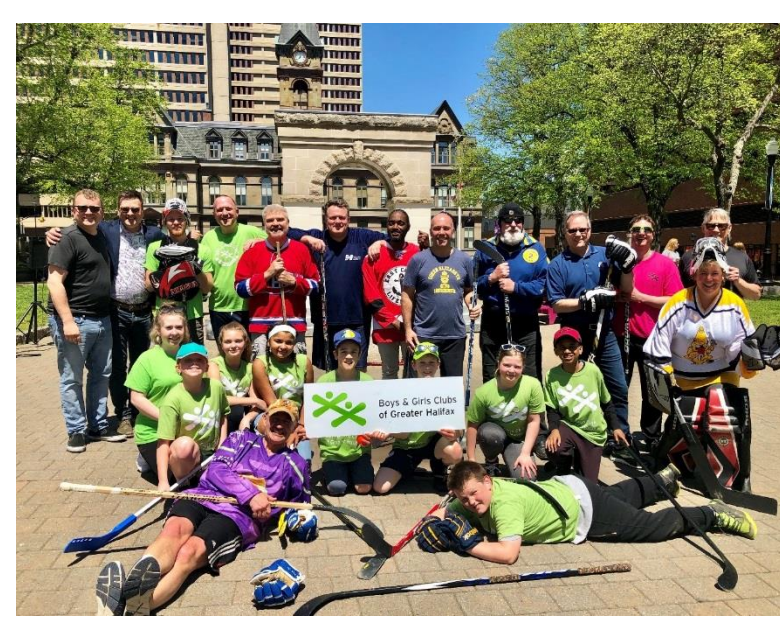
"Unplug to Connect" hockey game against the Boys and Girls Club

Join the Dartmouth North Community Food Centre Tuesday, July 16<sup>th</sup> from 5:00 - 7:30 p.m. to learn from a panel of guest speakers as they discuss everything from eviction prevention to health and safety conditions your landlord must maintain. You can find the full Dartmouth North Community Food Centre calendar here.