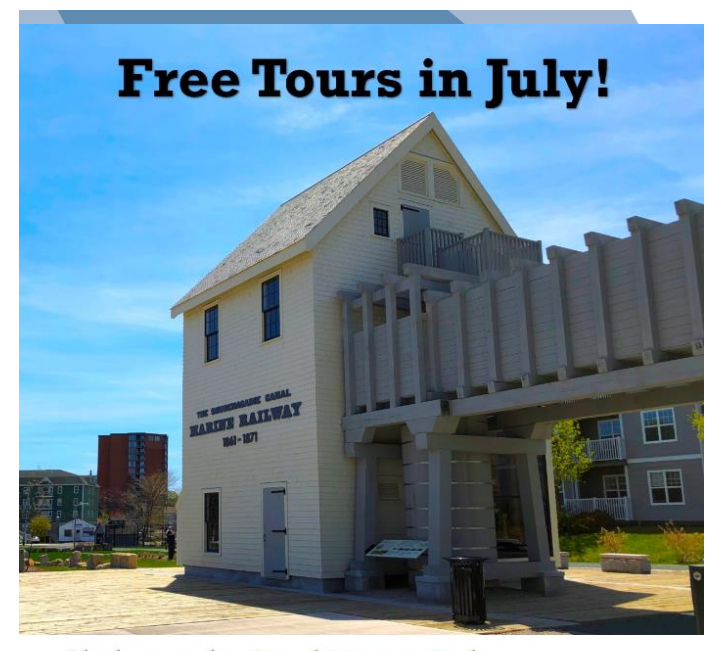
Shubenacadie Canal Marine Railway Free tours & live music every Saturday in July

The Halifax Regional Municipality will be completing much needed renovations to the bandstand, washrooms and changerooms at Beazley field. The work is expected to start mid-August and will be complete April 2020.