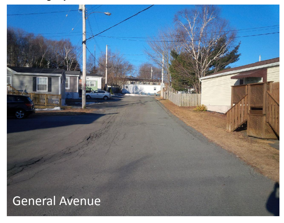
Category 2 – Located in a Mobile Trailer Park