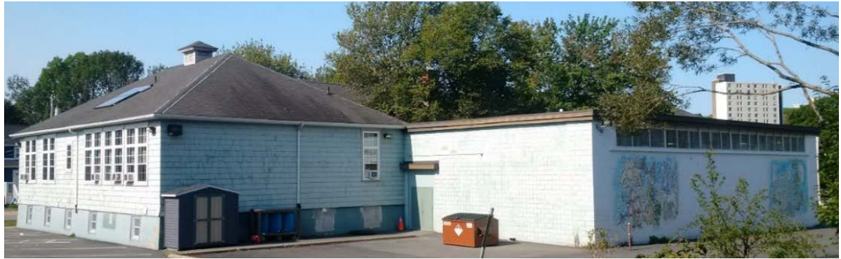
Figure 6: Rear gymnasium addition, 2018

In the 1960s a cinderblock gymnasium was constructed as an addition across the rear of the building. This addition altered the building's original "U" shape at the rear and created an enclosed outdoor courtyard in the center of the building.