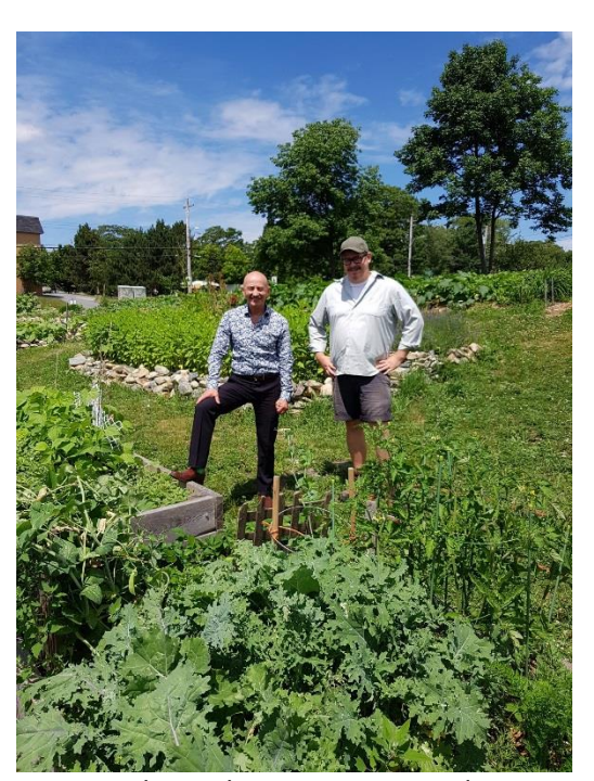
Dartmouth North Community Food Centre Farm

The roof will be replaced, increasing reliability, reducing energy costs, and helping to ensure the maintenance facility can operate without disruption. Read the staff report to learn more.