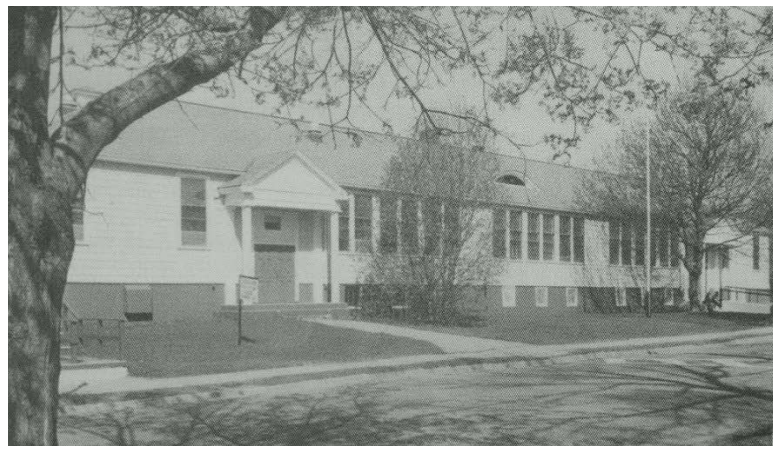
Figure 2: Findlay School building, 1993

Bungalow schools are generally one storey with very simple designs and include four to eight classrooms. They often do not provide common school amenities like gymnasiums, cafeterias or libraries. Bungalow schools became common in the early 20<sup>th</sup>