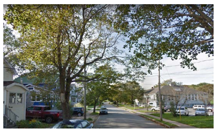
Figure 9: Elliot Street, 2017 (Google Maps)

The Findlay School building is located in а low densitv residential neighbourhood largely comprised of two storey detached houses. Its traditional one storey bungalow school design allows the Findlay School building to be compatible with the built form in the surrounding area. It also features a similar setback from Elliot Street as the surrounding houses, which allows the building to easily fit into the streetscape.