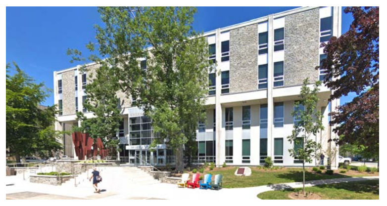
Figure 5: Dalhousie's Schulich School of Law, 2018 (Google Maps)