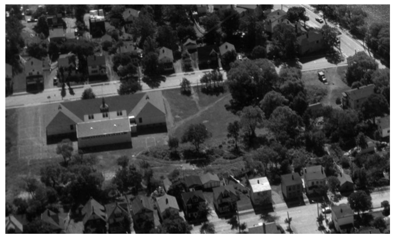
Figure 1: Aerial photograph of the Findlay School property, 1963

The building continued to operate as a school until 1971, when it was closed and converted into a community centre. The Findlay Community Centre is currently owned and operated by the Halifax Regional Municipality and provides a variety of services to the area.