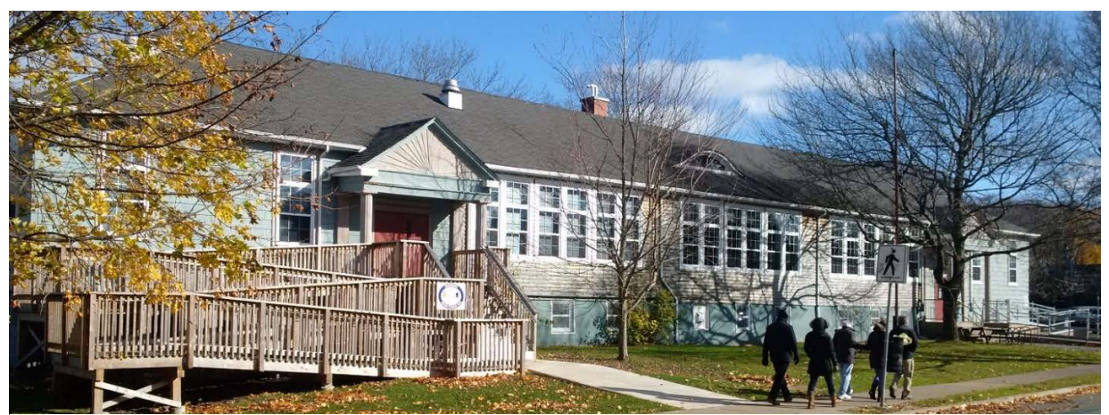
Figure 7: Findlay Community Center, 2018

The Findlay School building was designed in the Georgian Colonial Revival style. This is a classic style of architecture that is demonstrated in the Findlay School building by its gable roof and symmetrical façade with elaborate entryway porticos featuring columns on either side. The original Georgian style generally included elaborate and detailed designs that were greatly simplified as the style evolved in the 20<sup>th</sup> century. Detailing of the Findlay School building includes the long grouped windows across the façade, the fan detailing on the entranceway pediments and a rounded eyebrow window centred on the roof.