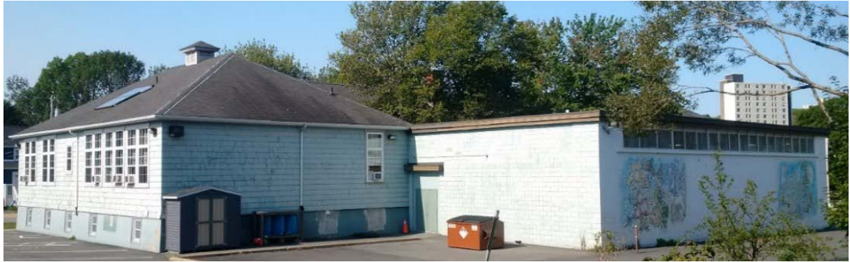
Figure 6: Rear gymnasium addition, 2018

In the 1960s a cinderblock gymnasium was constructed as an addition across the rear of the building. This addition altered the building's original "U" shape at the rear and created an enclosed outdoor courtyard in the center of the building.