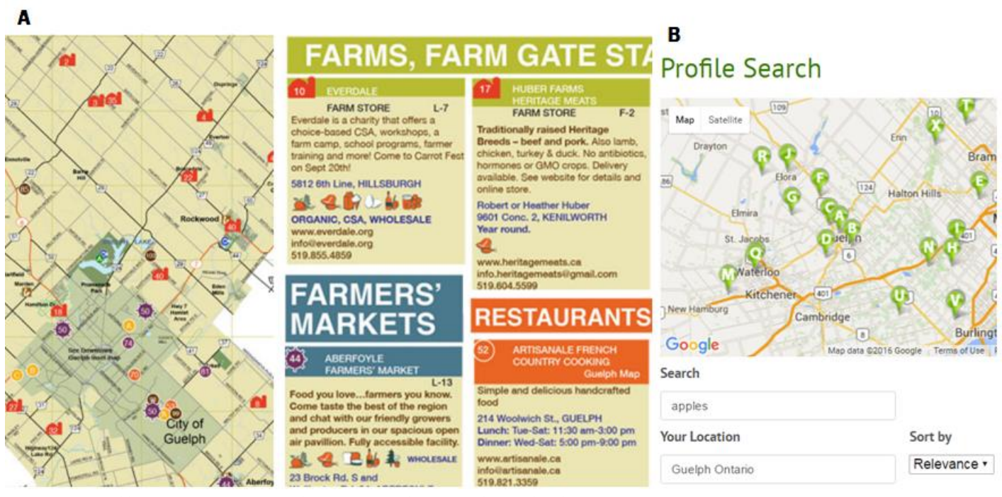
http://www.tastereal.com/wp-content/uploads/2015/05/LFM 2015 WEB2.pdf

The following graphics show (a) some clippings from the Taste Real Local Food Map, and also (b) the tool for searching a database of local foods available in nearby communities.