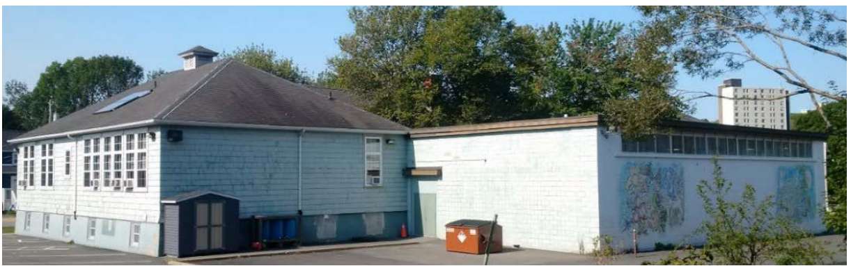
Figure 6: Rear gymnasium addition, 2018

In the 1960s a cinderblock gymnasium was constructed as an addition across the rear of the building. This addition altered the building's original "U" shape at the rear and created an enclosed outdoor courtyard in the center of the building.