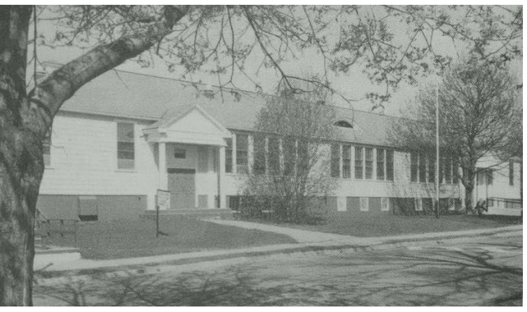
Figure 2: Findlay School building, 1993

Bungalow schools are generally one storey with very simple designs and include four to eight classrooms. They often do not provide common school amenities like gymnasiums, cafeterias or libraries. Bungalow schools became common in the early 20<sup>th</sup>