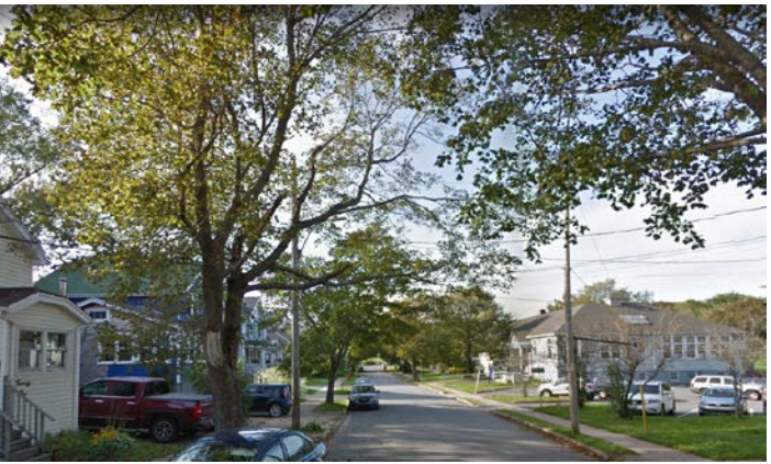
Figure 9: Elliot Street, 2017

The Findlay School building is located in a low density residential neighbourhood largely comprised of two storey detached houses. Its traditional one storey bungalow school design allows the Findlay School building to be compatible with the built form in the surrounding area. It also features a similar setback from Elliot Street as the surrounding houses, which allows the building to easily fit into the streetscape.