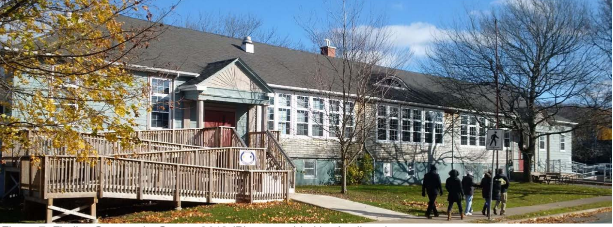
Figure 7: Findlay Community Center, 2018

The Findlay School building was designed in the Georgian Colonial Revival style. This is a classic style of architecture that is demonstrated in the Findlay School building by its gable roof and symmetrical façade with elaborate entryway porticos featuring columns on either side. The original Georgian style generally included elaborate and detailed designs that were greatly simplified as the style evolved in the 20<sup>th</sup> century. Detailing of the Findlay School building includes the long grouped windows across the façade, the fan detailing on the entranceway pediments and a rounded eyebrow window centred on the roof.