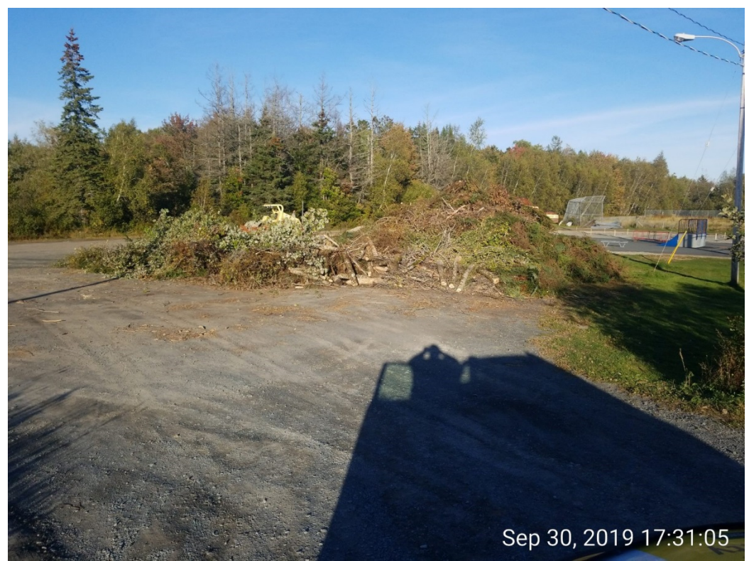
Beaver Bank Road, Beaver Bank