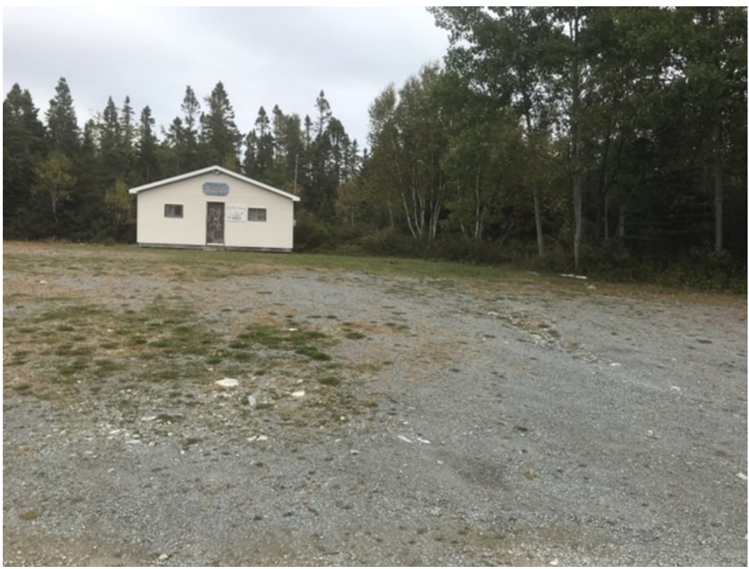
Sheet Harbour Community Centre