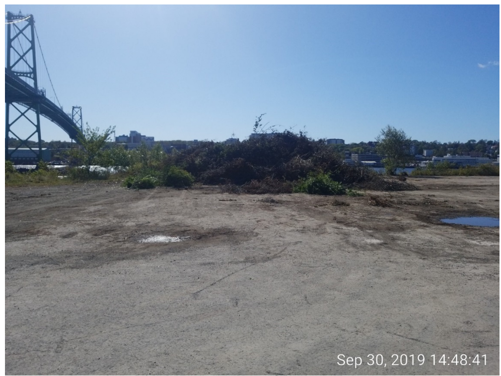
Lyle Street, Dartmouth