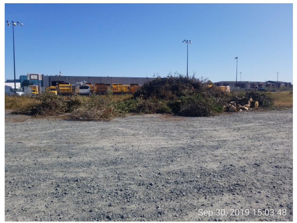
Thornhill Drive, Dartmouth