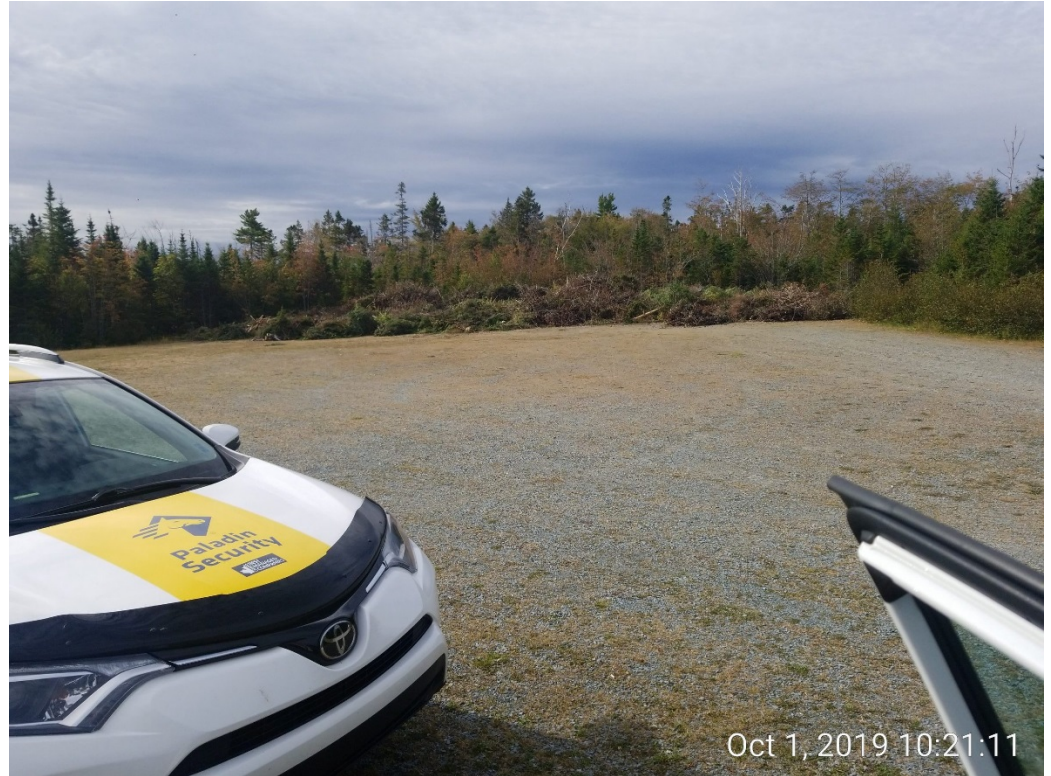
Cheviot Hill, Porters Lake