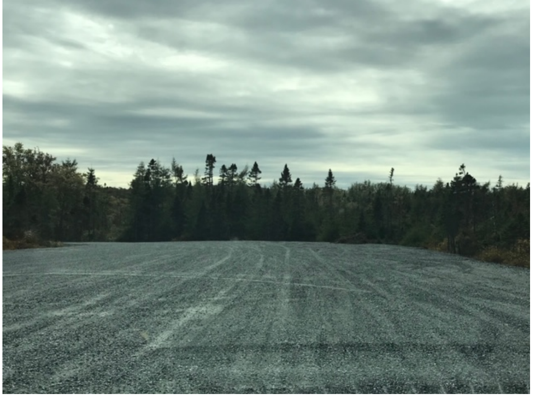
Lake Charlotte Boat Launch