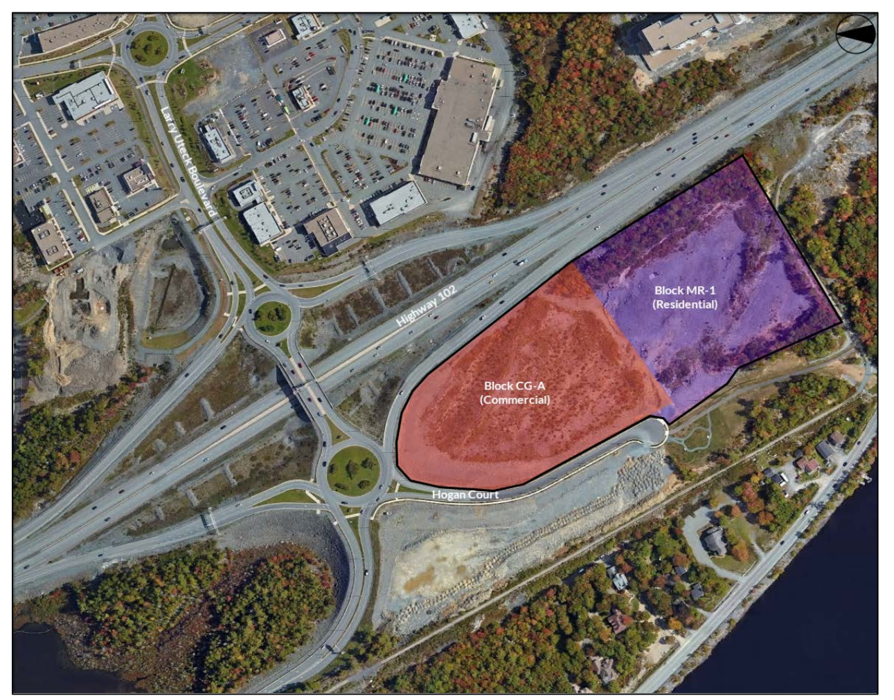
Figure 1: Site Context

Description of Development Agreement Amendment: The original development agreement allowed a population of 1476 people on Hogan Court. An amendment allowed the transfer of 265 people to Bedford South, leaving a maximum population of 1211 people. The agreement allows for a maximum of 200 residential units or 450 persons (2.25 persons per unit), the remainder of population is allotted to commercial development. Of the commercial population, 298 persons have already been used.