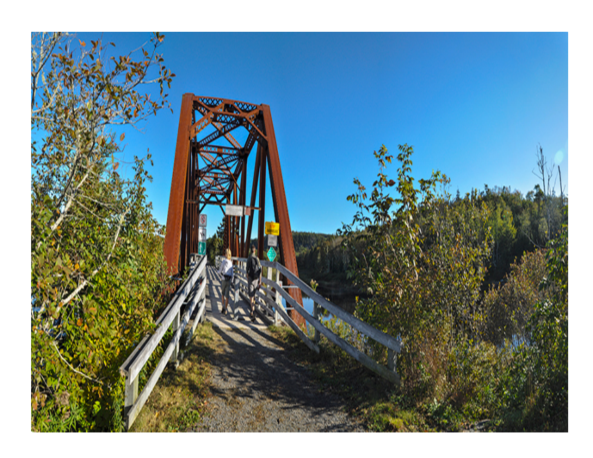
Musquodoboit Trail - Built and maintained by Musquodoboit Trailways Association