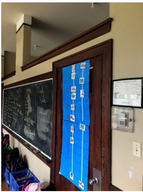
Retractable Wall between Classrooms