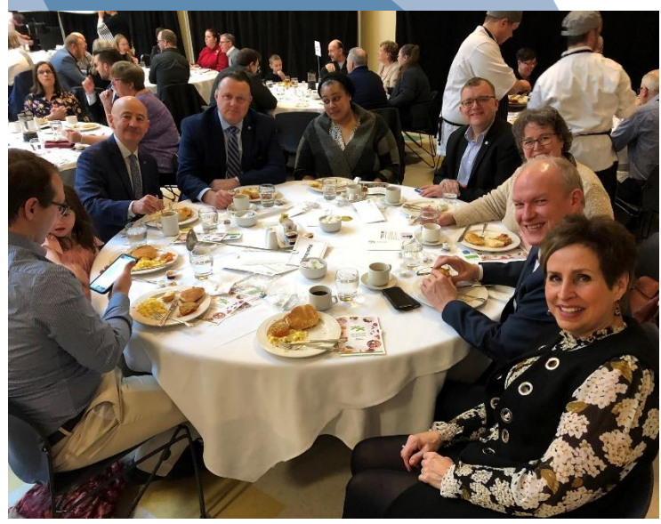
Boys and Girls Club Fundraising Breakfast

A public information meeting will be scheduled once staff have reviewed the application and then the development agreement will need to be approved by the Harbour East Marine Drive Community Council before proceeding.