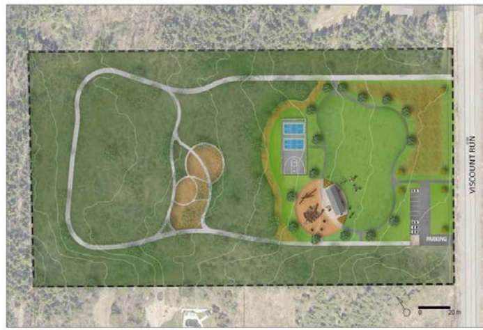
VISCOUNT RUN PARK CONCEPT PLAN

I am pleased to announce an exciting park plan being developed for Viscount Run Park in Kingswood North.