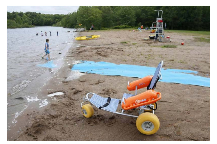
Floating Wheelchair at Chocolate Lake Beach