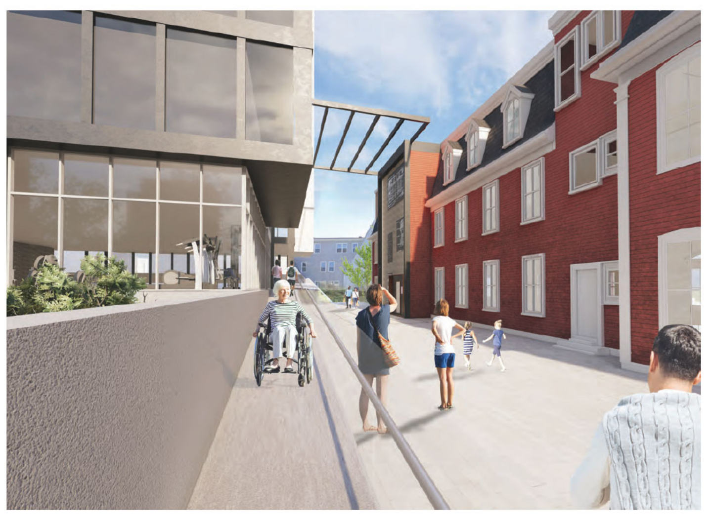
Proposed rear yard and "heritage wall"