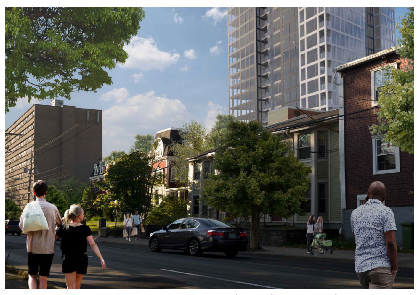
Proposed new construction as seen from Gottingen Street