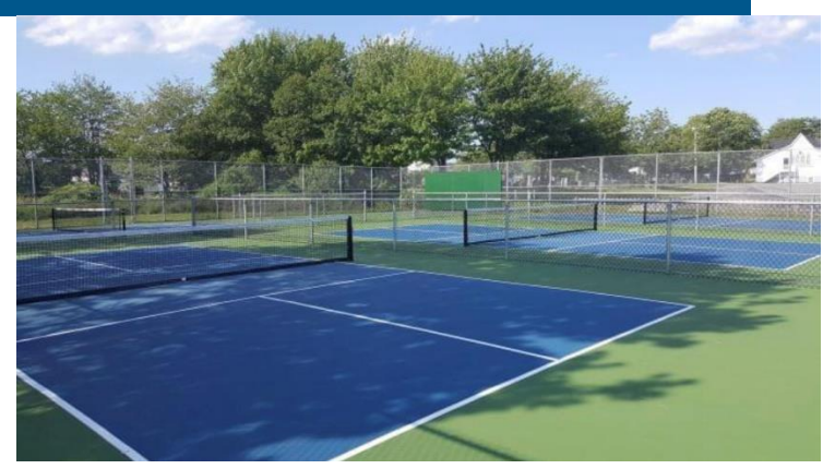
Morash Park has the Halifax Regional Municipalities first exclusively Pickleball court!

People who come in contact with blue-green may experience skin and eye irritation, sore throat, fever, nausea and vomiting and/or diarrhea. Children and immune-compromised individuals are at a higher risk. If you have these symptoms, you are advised to seek medical assistance. To learn more about algae blooms, visit our website.