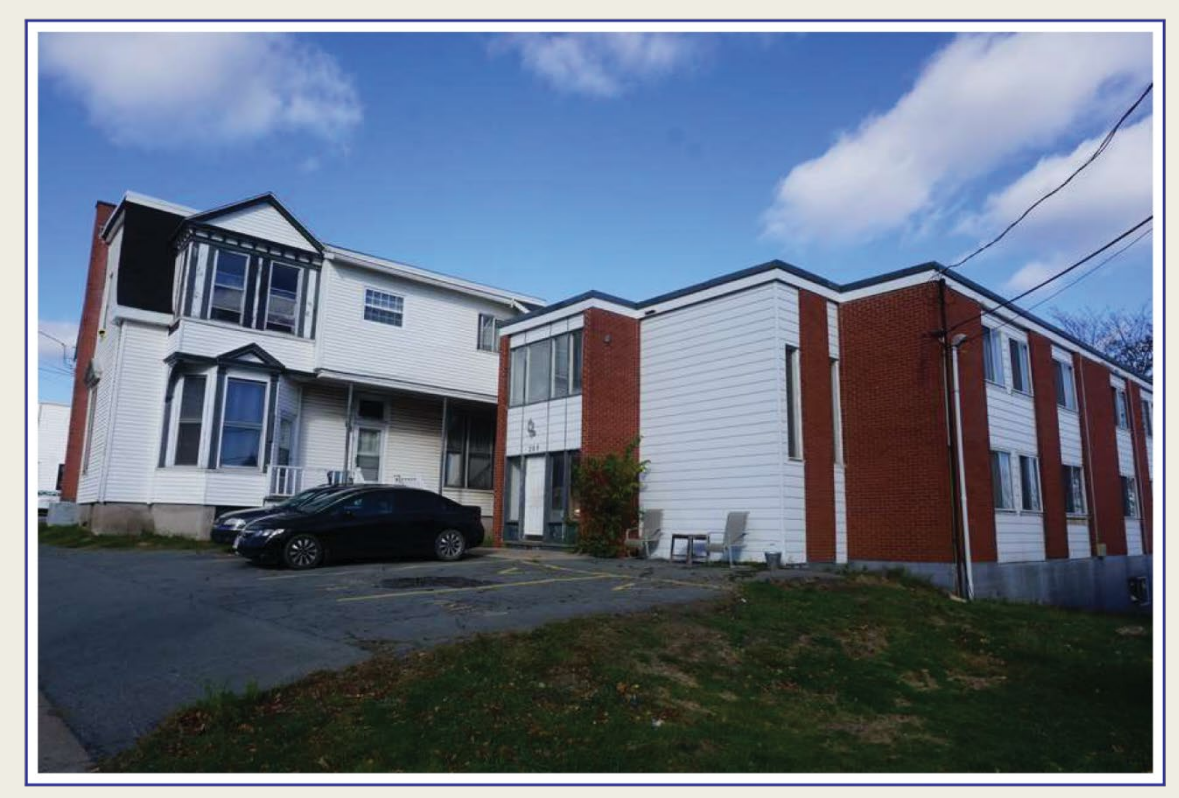
View of existing building from southwest corner