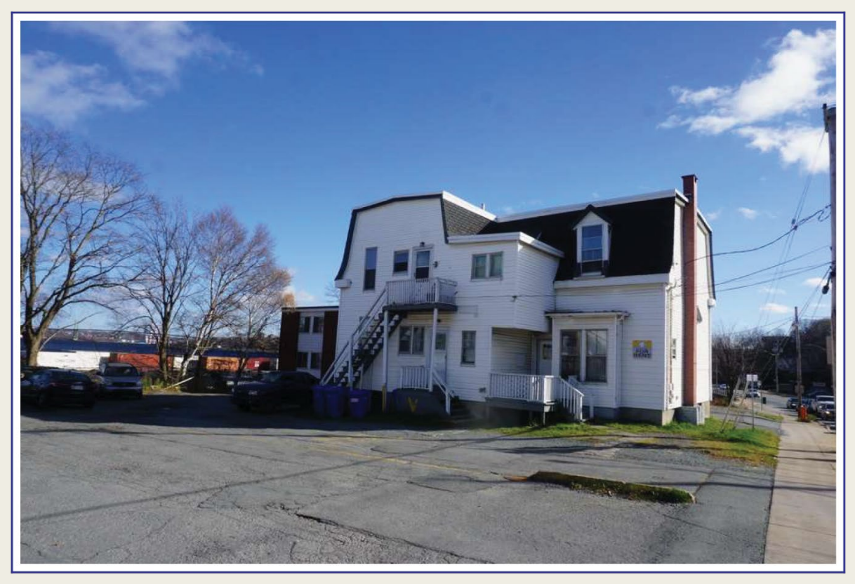
View of existing building from northwest corner