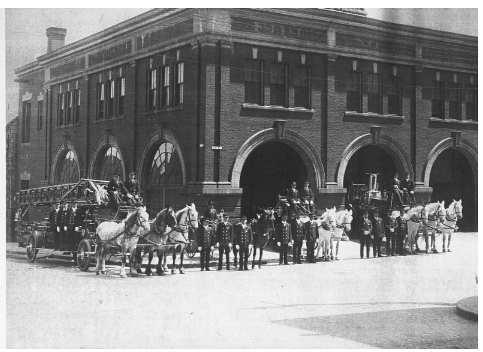
Figure 12: Bedford Row Station (Fire Station 4, now McKelvie's Restaurant), 1910 BuiltHalifax: Local Architectural History and Theory, (March 29, 2017), accessed from https://halifaxbloggers.ca/builthalifax/2017/03/4-fire-station/

Heritage Division, N.S. Dept. of Tourism, Culture and Heritage, Bell Road elevation of barn, Bengal Lancers Property , Halifax, Nova Scotia, 2005, accessed from https://www.historicplaces.ca/en/rep-reg/imageimage.aspx?id=3316#i1