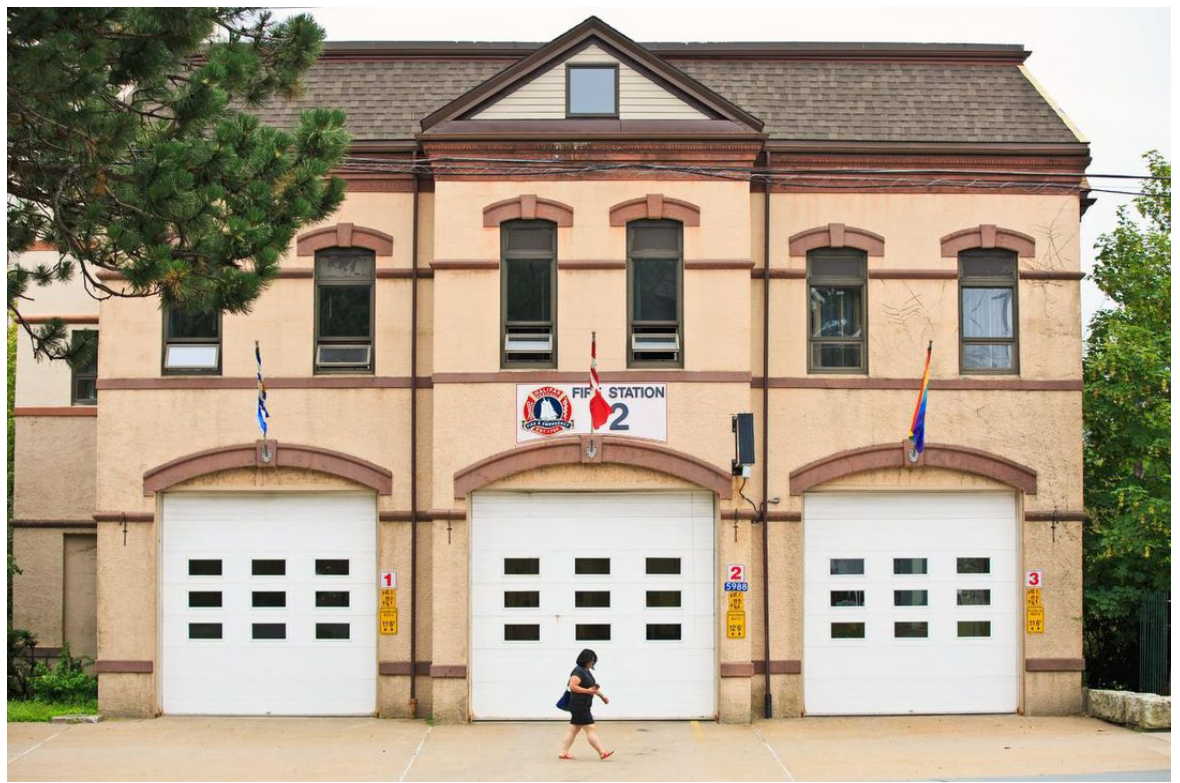
Figure 7: Morris Street Station, 1999