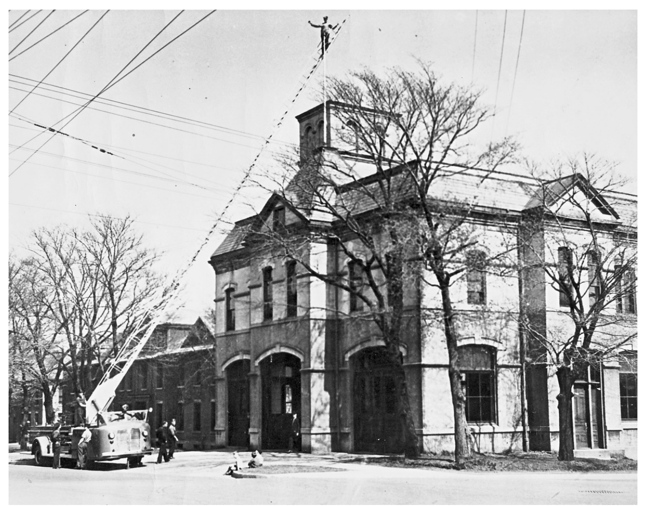
Figure 4: Morris Street Station, 1945