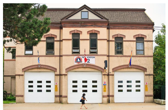
Figure 1: Morris Street Station

On August 13, 2019, Regional Council directed staff to examine the potential of including 5988 University Avenue in the Registry of Heritage Property for the Halifax Regional Municipality (see Figure 1). The subject property is located at the southeast guadrant of the University Avenue / Robie Street intersection and is the site of the historic Morris Street Engine House (now known as Fire Station #2). The construction of the twostorey structure began in 1907 and concluded the following year. The building was built by George B. Low (who was one of Halifax's pioneers in concrete building construction) and designed by William B. Fidler. Morris Street Engine House has served Canada's oldest fire service for over 110 years, and today it acts as a repository for many of the department's historic artifacts.