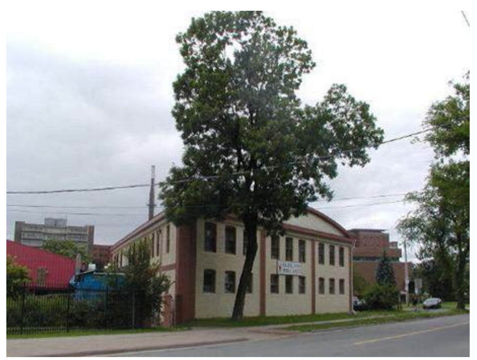
Figure 11: Bengal Lancers Building, 2005

Heritage Division, N.S. Dept. of Tourism, Culture and Heritage, Bell Road elevation of barn, Bengal Lancers Property , Halifax, Nova Scotia, 2005, accessed from https://www.historicplaces.ca/en/rep-reg/imageimage.aspx?id=3316#i1