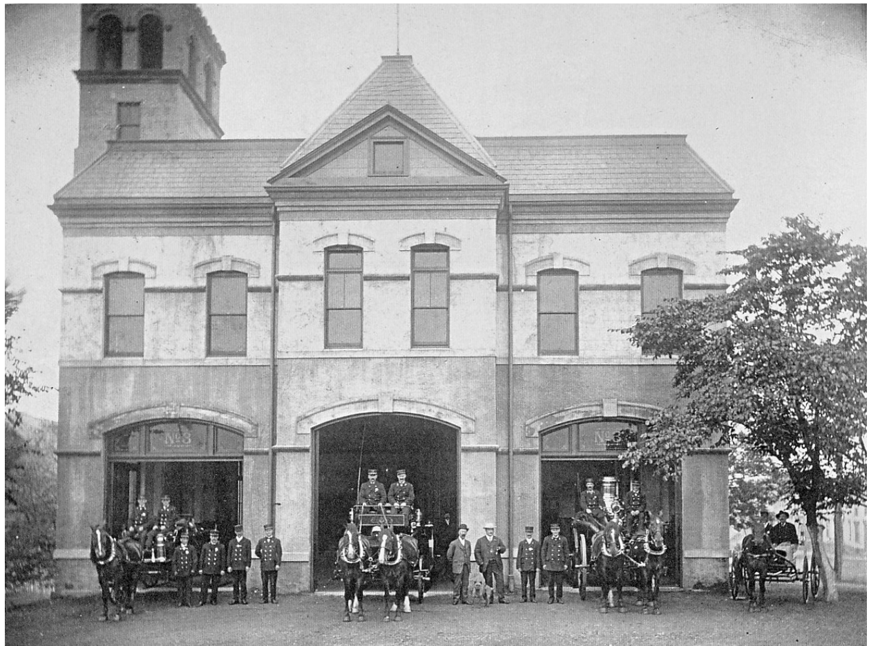
Figure 3: Morris Street Station, 1910