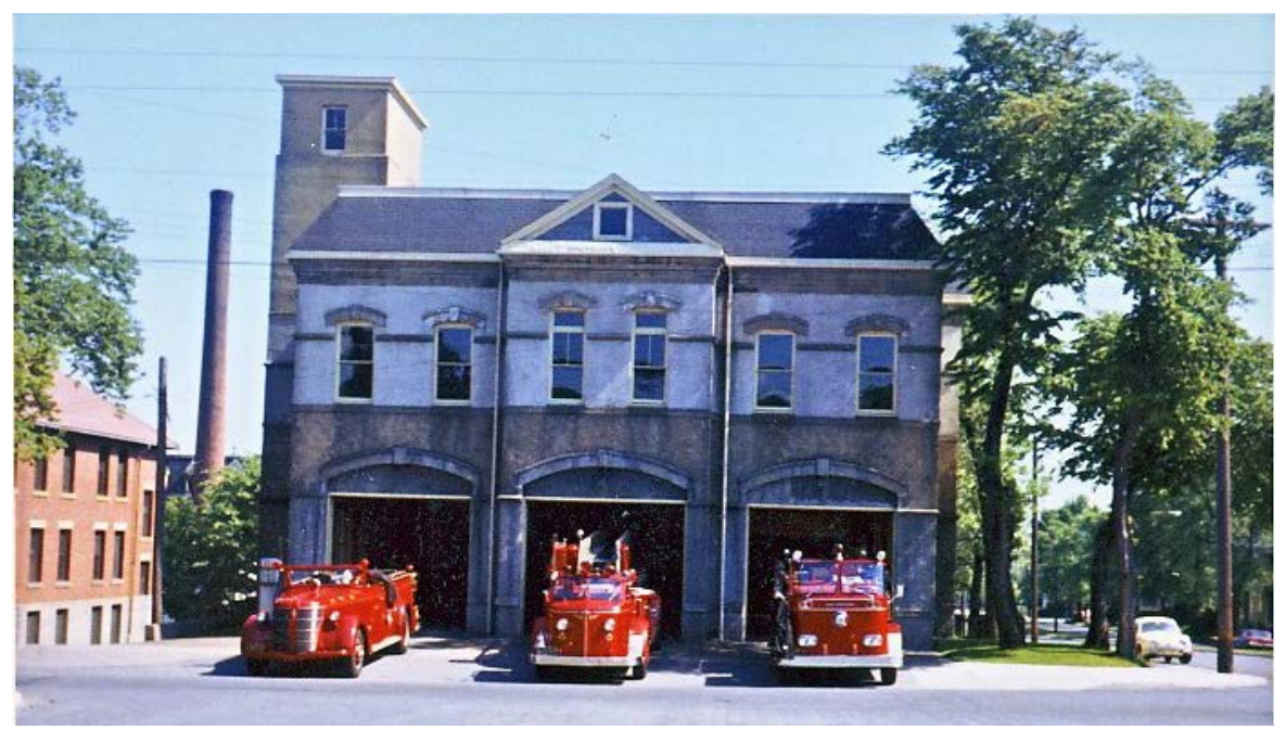
Figure 6: Morris Street Station, 1962