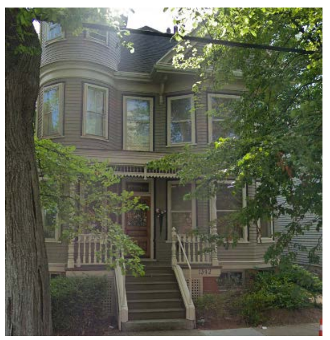
Figure 2: 1342 Robie Street in 2009

The dwelling is an asymmetrical Queen Anne style home. It has a steeply pitched gable roof with a dormer on either side. The dwelling's front left side has a three-storey round tower (i.e., turret) with a conical roof. The facade is balanced by a semi-