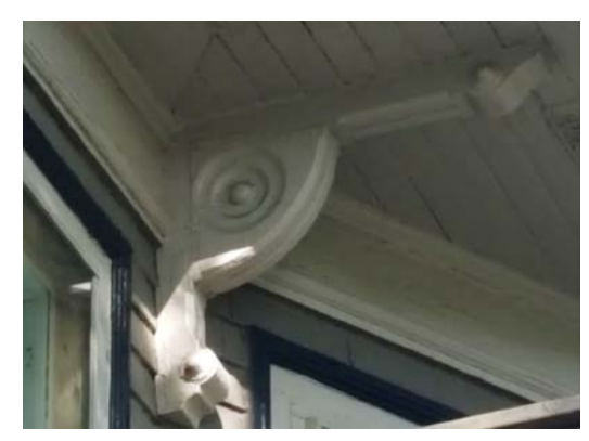
Figure 7: Console Under Eave

Except for the addition and renovation to the kitchen the interior is all original and has beautiful woodwork throughout. Considering the age of the dwelling there has been very little change to it.