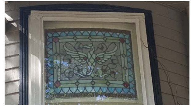
Figure 3: 1/3 Window with Ornate Decorative Bird