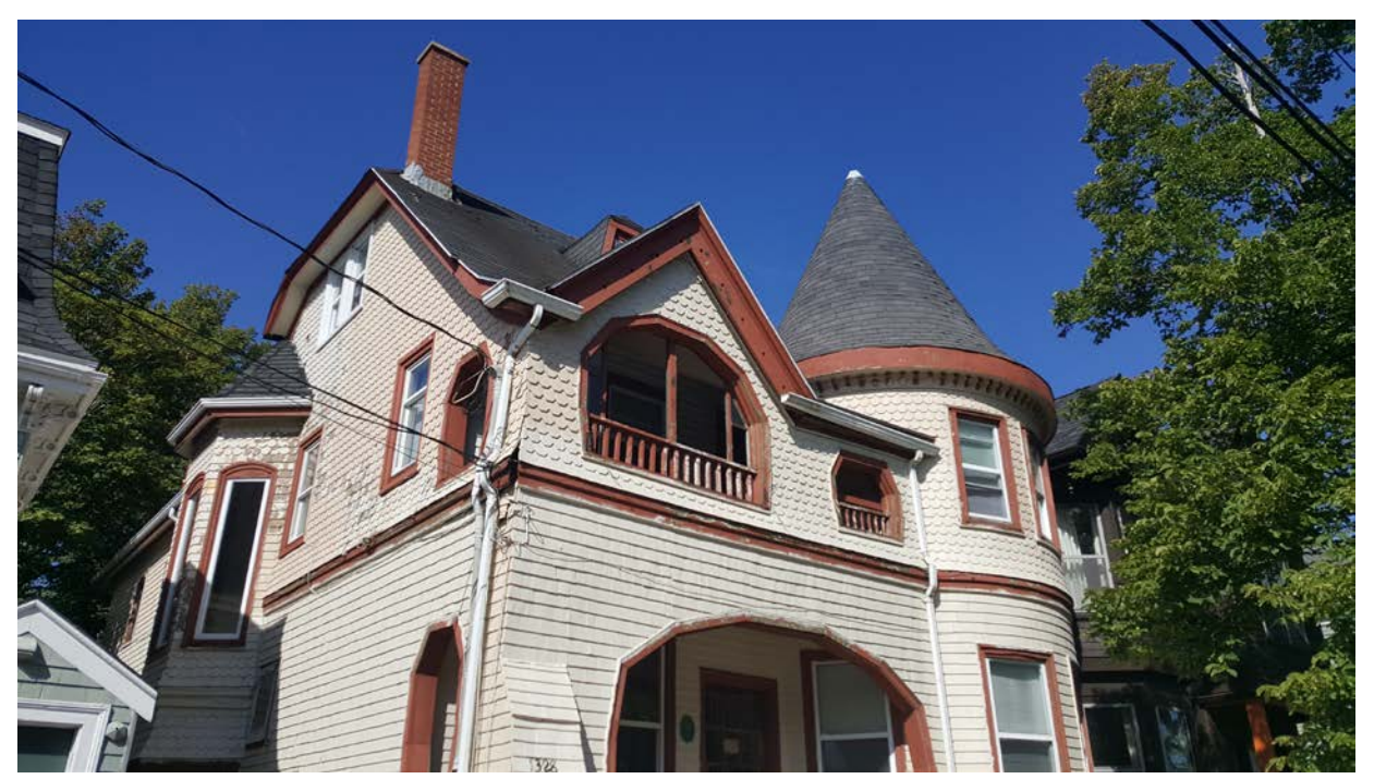
Figure 8: 1328 Robie Street, Louis Kaye House