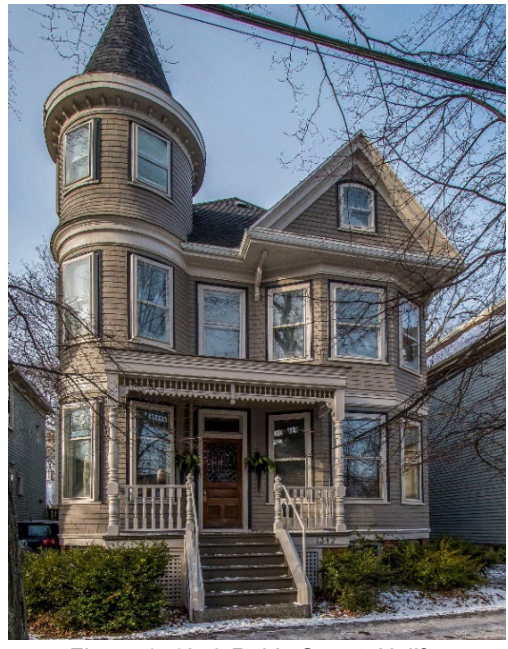
Figure 1: 1342 Robie Street, Halifax

The dwelling was likely constructed in 1906 and as such, staff recommend a score of 9 points for age.