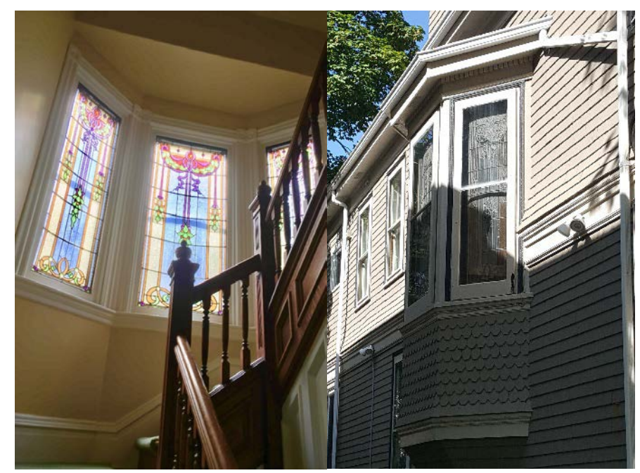
Figure 6: Interior Oriel Window; Exterior of Bay Window with Scalloped Shingles

Many, if not all, windows are original and in their original location. Aluminum or wood storm windows have been added to protect the original stained glass and/or prevent heat loss.