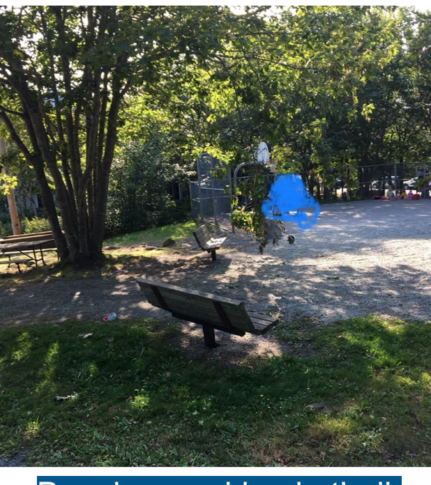
Benches and basketball court