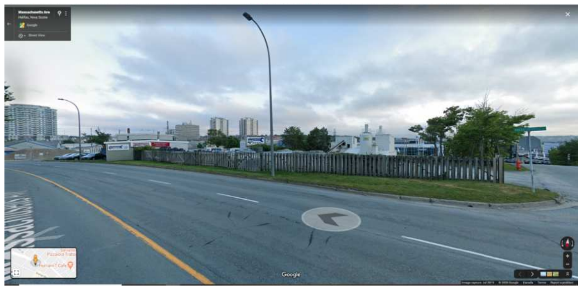
View 2 - Looking Northwest from Residential on Massachusetts