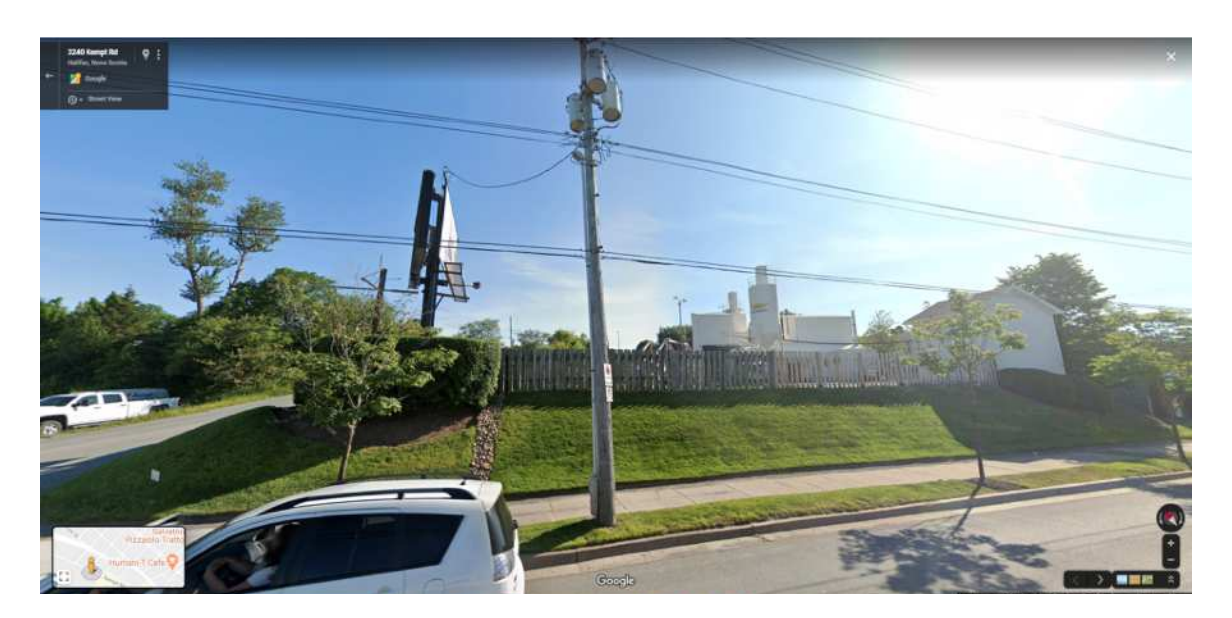
View 4 - Looking east from Kempt Road towards Massachusetts Avenue.