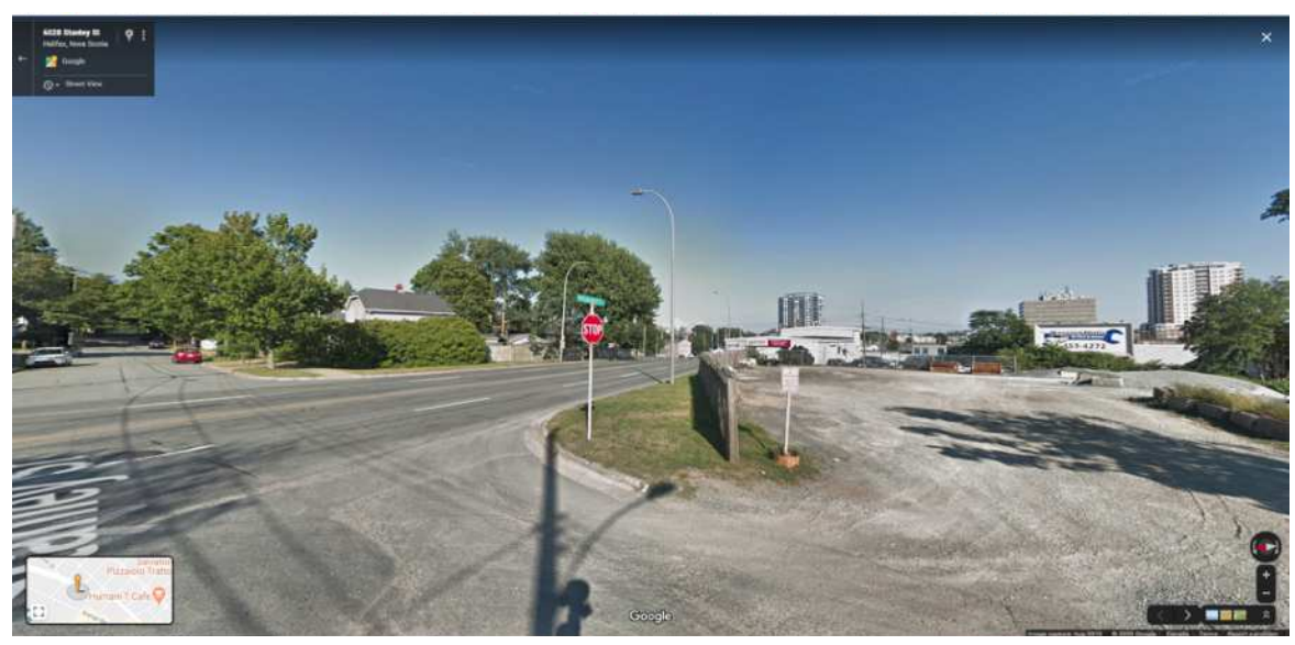
View 3 - Upper driveway showing adjacent Residential.

facility straddles both, taking advantage of the excellent truck access while transitioning into existing residential. This is a strikingly similar context as found at 538 Pleasant Street in Dartmouth. The images below show views of the reference facility and how it fits into the existing neighbourhood.