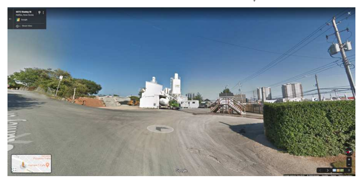
View 1 - Facility view, looking north.