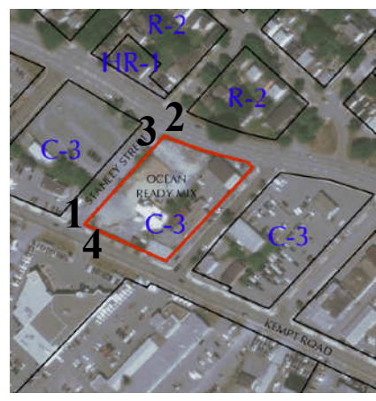
Stanley Street View Locations

The Ocean Ready-Mix site is bordered by commercial properties of the Kempt Road/Robie Street/Massachusetts Avenue arterial corridor on one side, with its many businesses and associated traffic, while on the other is a typical Halifax residential neighbourhood (R-2). The reference ready-mix