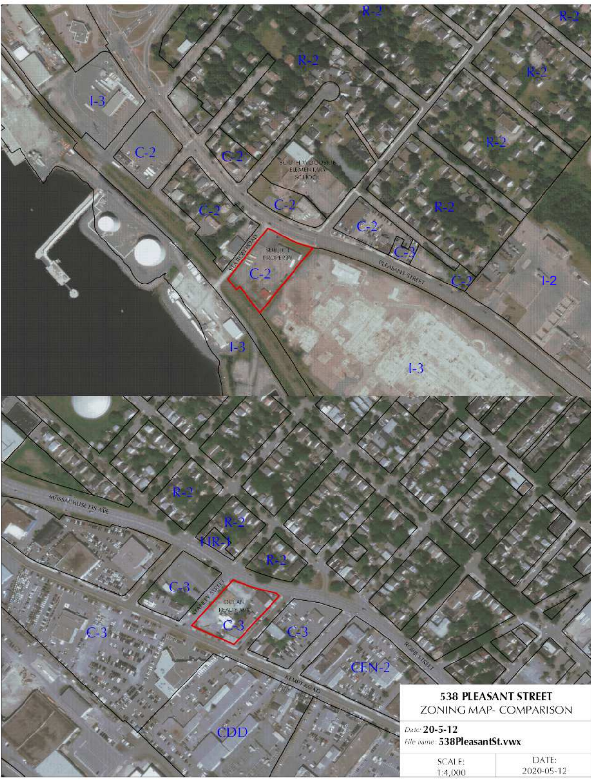
Proposed Site (top) and Ocean Ready-Mix example (bottom)