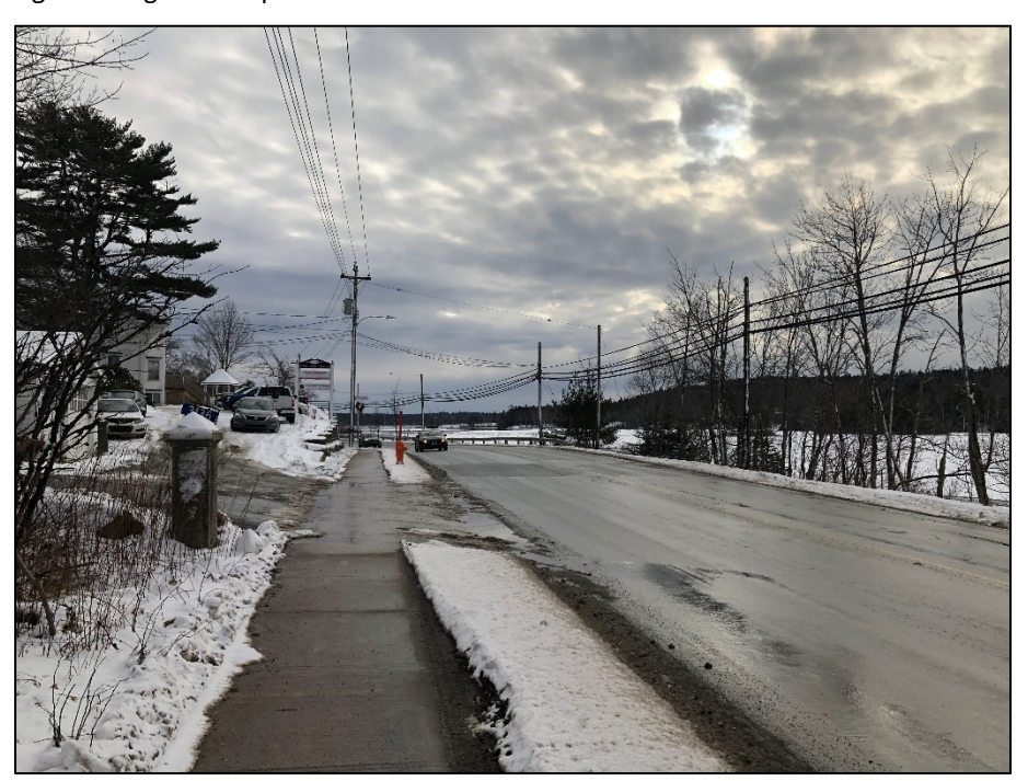
Figure 5: Left of Proposed Access Location

Trip Generation: The vehicle trip generation estimates for the development were quantified using trip generation rates from the 10th edition of the Institute of Transportation Engineers (ITE) Trip Generation Manual. The weekday morning (AM) and afternoon (PM) peak hour trip generation estimates for the proposed development are summarized in Table 1. On a typical weekday, the proposed development is expected to generate 9 vehicle trips in the morning peak hour (2 trips in/7 trips out) and 11 vehicle trips in the afternoon peak hour (7 trips in/4 trips out).