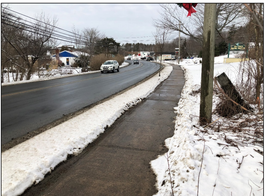
Figure 4: Right of Proposed Access Location