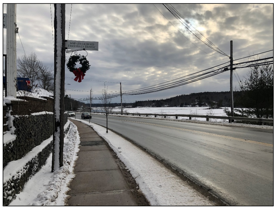
Figure 2: Nova Scotia Trunk 2