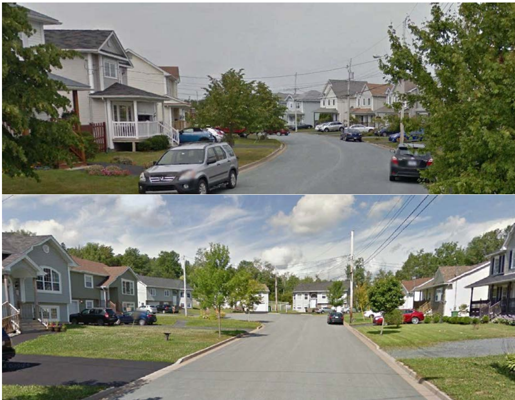
Figure 4 —The top image is a streetscape of 40’ wide lots (Morris Lake Estates), while the bottom is a streetscape of 60’ lots on Guptil Court, within the R-1 Zone of the Beaverbank, Hammonds Plains, Upper Sackville plan area.

Preservation of Local Character – The MPS provides direction to ensure the rural character of the Beaver Bank, Hammond Plains, and Upper Sackville areas are maintained. The Residential Designation which contains all serviced R-1 lands, are intended to have a suburban, single family character. The current proposed amendment to reduce frontage size maintains current land use provisions and is consistent with suburban character. See Figure 4 below which compares a suburban streetscape built out at 60’ frontage compared to 40’ frontages. Further, the revised concept plan for Carriagewood Estates will develop lots consistent with current R-1 frontage requirements adjacent to existing development, to create a seamless transition to this development.