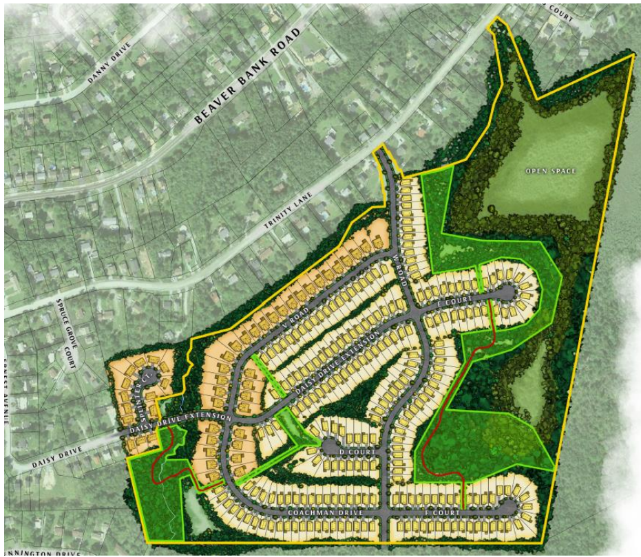
Figure 1 – The proposed Conceptual Site Plan for Carriagewood Estates (subject to this amendment). See attachment 2 for full detailed plan.