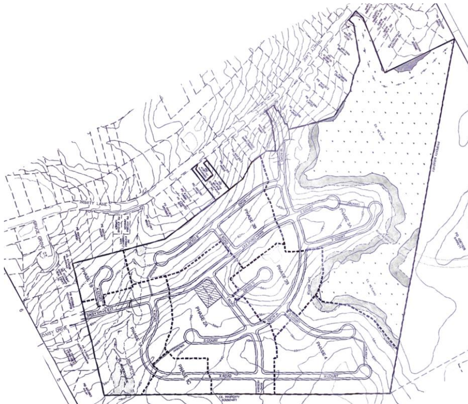
Figure 2 – The existing approved concept plan, designed in accordance with existing standards.