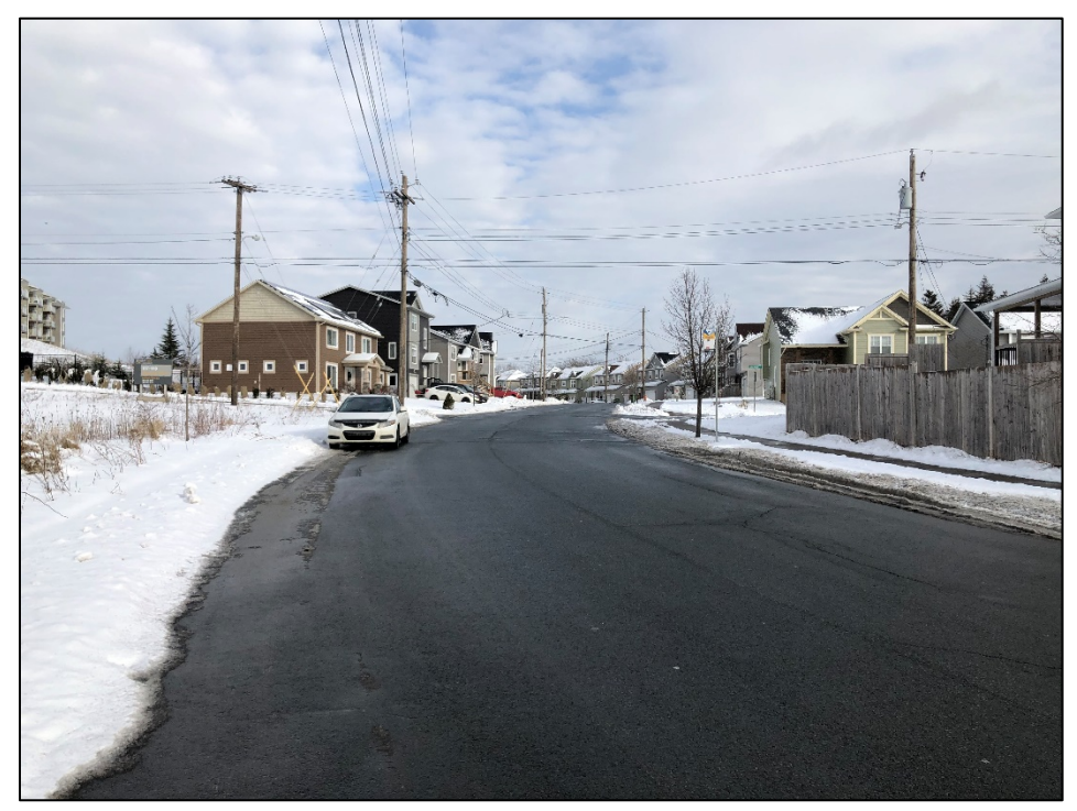
Figure 2: Hanwell Drive