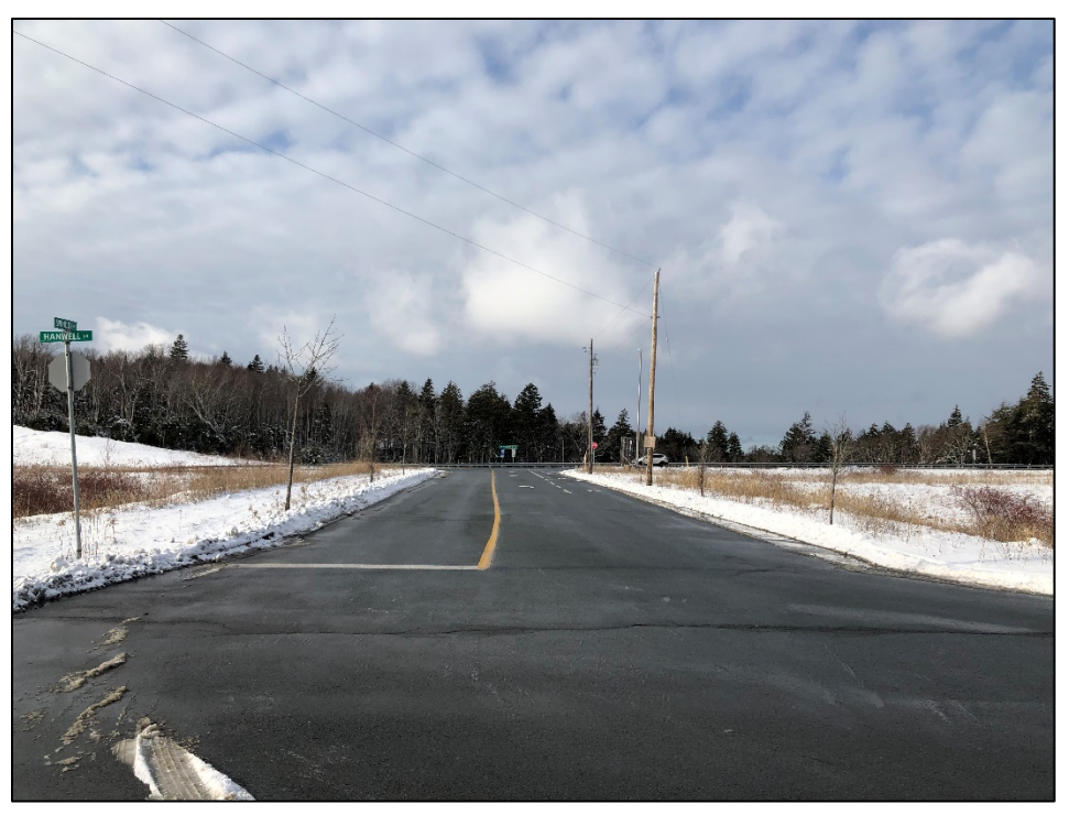
Figure 3: Swindon Drive