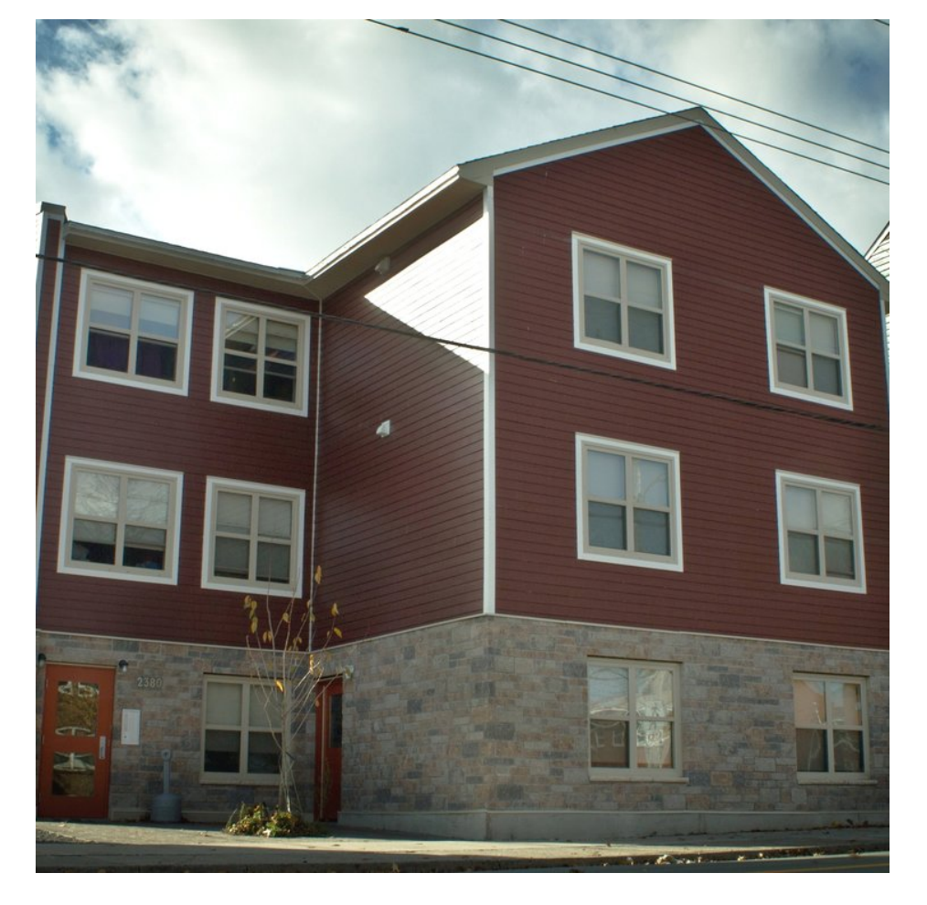
The Alders, Halifax