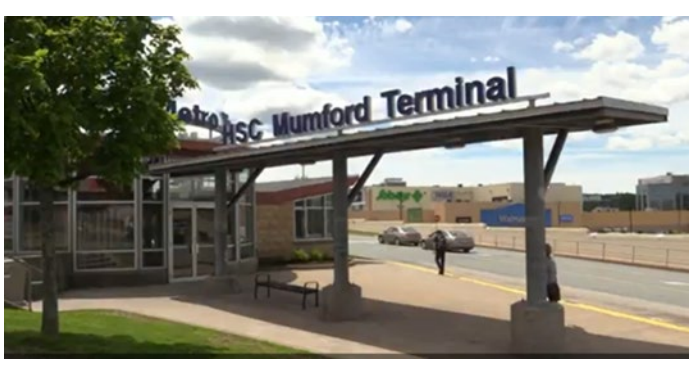
Halifax Transit Red Seal Mechanics:

To view other employment opportunities with HRM, please visit our website