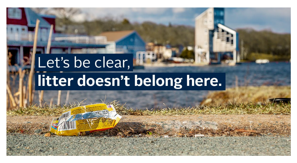
Figure 1: Sample Litter Awareness Campaign Ad

SWR developed the Let's Be Clear – Litter Doesn't Belong Here campaign under Council direction<sup>4</sup> in 2018 with the objective to put focus on common litter items and show where they are frequently found. The ads feature easily recognized landmarks around HRM to connect the pride residents have in our municipality with the negative effects of litter. A sample of one of the ads is shown in Figure 1 below. The campaign can be promoted year-round through paid advertisements, digital screens in HRM facilities and social media posts. This campaign raises awareness of the issue of litter and is a call to action.