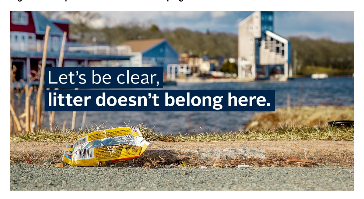
Figure 1: Sample Litter Awareness Campaign Ad

SWR developed the Let's Be Clear – Litter Doesn't Belong Here campaign under Council direction<sup>4</sup> in 2018 with the objective to put focus on common litter items and show where they are frequently found. The ads feature easily recognized landmarks around HRM to connect the pride residents have in our municipality with the negative effects of litter. A sample of one of the ads is shown in Figure 1 below. The campaign can be promoted year-round through paid advertisements, digital screens in HRM facilities and social media