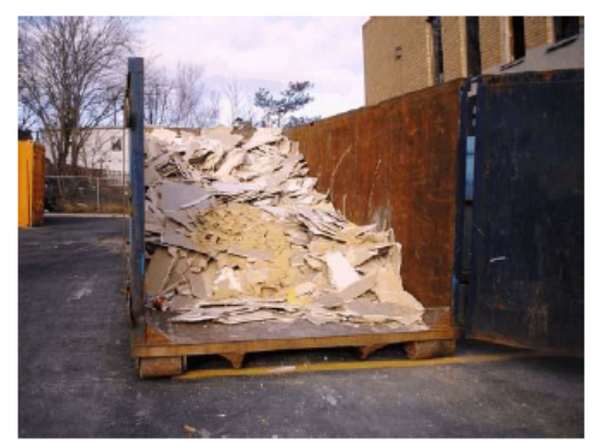
Having dedicated containers on site for sorting material saves time and disposal fees.