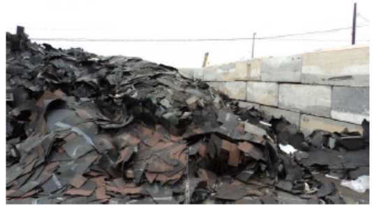
Asphalt shingles delivered to a C&D facility for recycling.