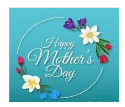
No language can express the power, beauty and heroism of a mother's love. ~ Edwin Chapin

Please send me your community photos, so that I'm able to feature them. Please provide a description of each photo you send. When I post it as a screen background, I'll let everyone know where it came from and who was gracious enough to share it with us all.