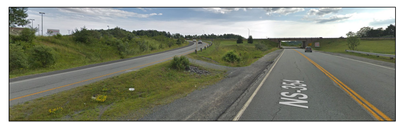
Figure 1: Crossing Location of Beaver Bank Connector and Highway 101 Off-ramp (Exit 2)

As a shortcut, residents of this area have been walking along the access ramps to Highway 101, then waiting for gaps in traffic to cross two major legs of traffic: The Beaver Bank Connector and the Exit 2 off-ramp of Highway 101 (See Figure 1 and Attachment A). The Beaver Bank Connector (Hwy 354) is two lanes wide and a posted 70 km/h speed limit. The 101 off-ramp (Exit 2) is one lane wide and a posted 50 km/h speed limit. Counts are not available to estimate the exact number of pedestrians who are using this shortcut route, however, pedestrian wear-paths would suggest that this route is being used by some residents.