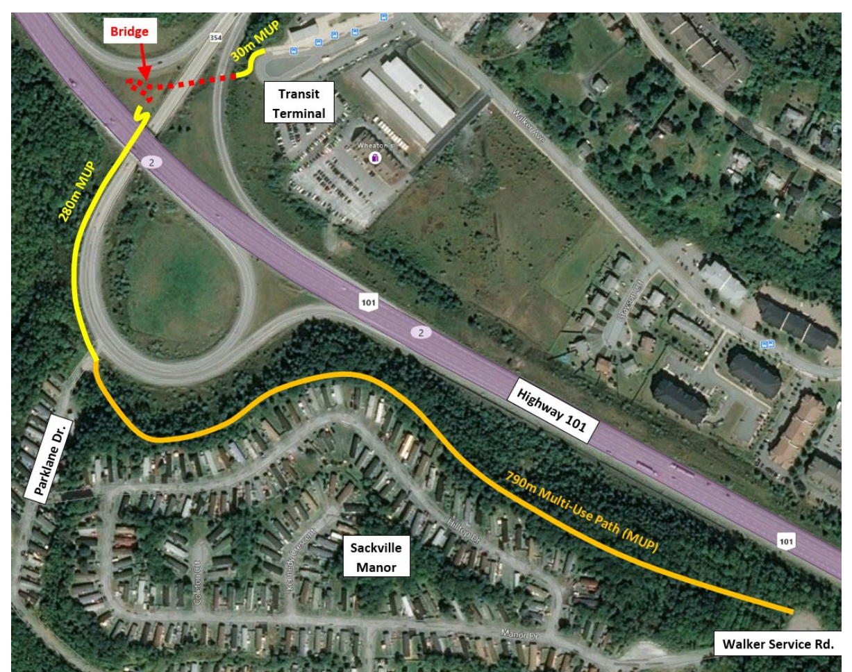
Figure 3: Option 2 proposed multi-use pathway at Beaver Bank Connector and Highway 101 Off-ramp (Exit 2)

To create a continuous route and avoid dead-ending a municipal facility (see Property Ownership discussion above), an additional 790m long trail would need to be constructed within the provincial right-of-way connecting Walker Service Road to the end of Parklane Drive.