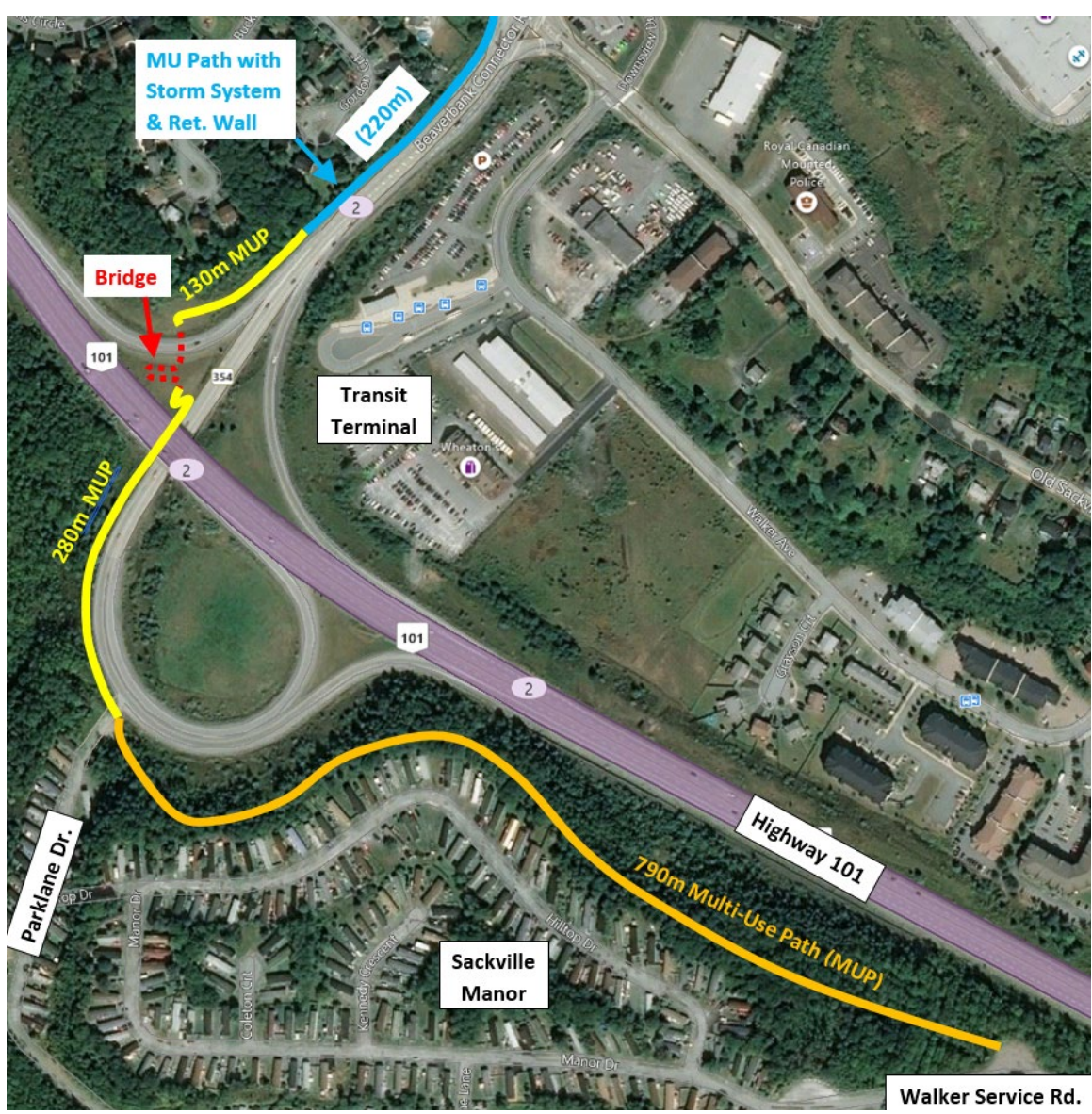
Figure 2: Option 1 proposed multi-use pathway at Beaver Bank Connector and Highway 101 Off-ramp (Exit 2)

To create a continuous route and avoid dead-ending a municipal facility (see Property Ownership discussion above), an additional 790m long multi-use pathway would need to be constructed within the provincial right-of-way connecting Walker Service Road to the end of Parklane Drive.