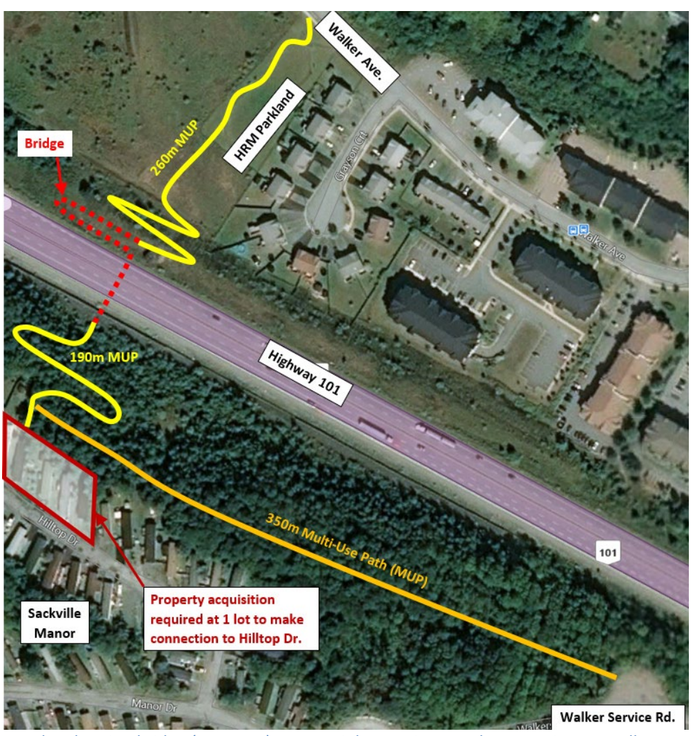
Figure 4: Option 3 proposed pedestrian bridge (overpass) across Highway 101 w park connection to Walker Ave

To create easy access to this multi-use pathway for the residents of Sackville Manor, it would be beneficial to create a connection directly into the mobile home park at Hilltop Drive. This would require property acquisition and the removal of 1 mobile home unit. The owner of Sackville Manor did not seem optimistic about the potential loss of property to create this multi-use pathway connection (see Property Ownership section). Therefore, AT users would need to leave the mobile home park and join the pathway from Walker Service Road to cross the highway, adding an additional 350m+ onto each trip.