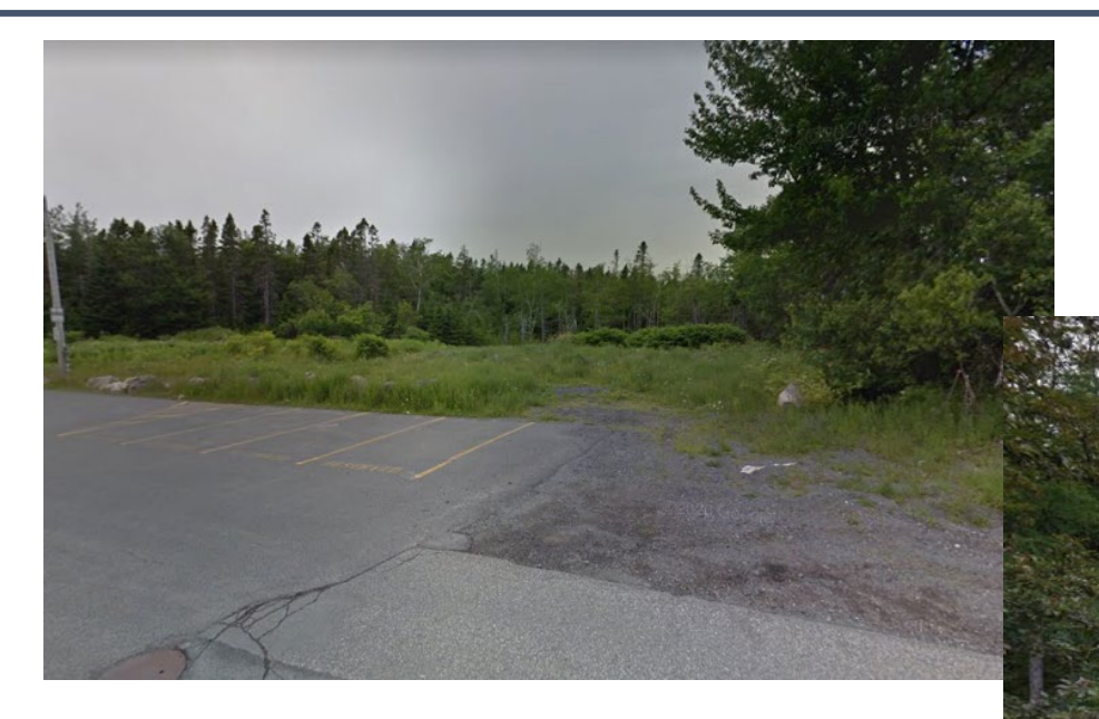
Subject site at Myra Road