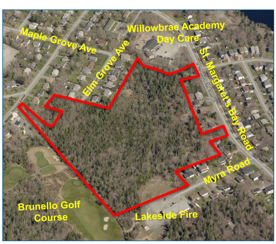
Site Boundaries in Red