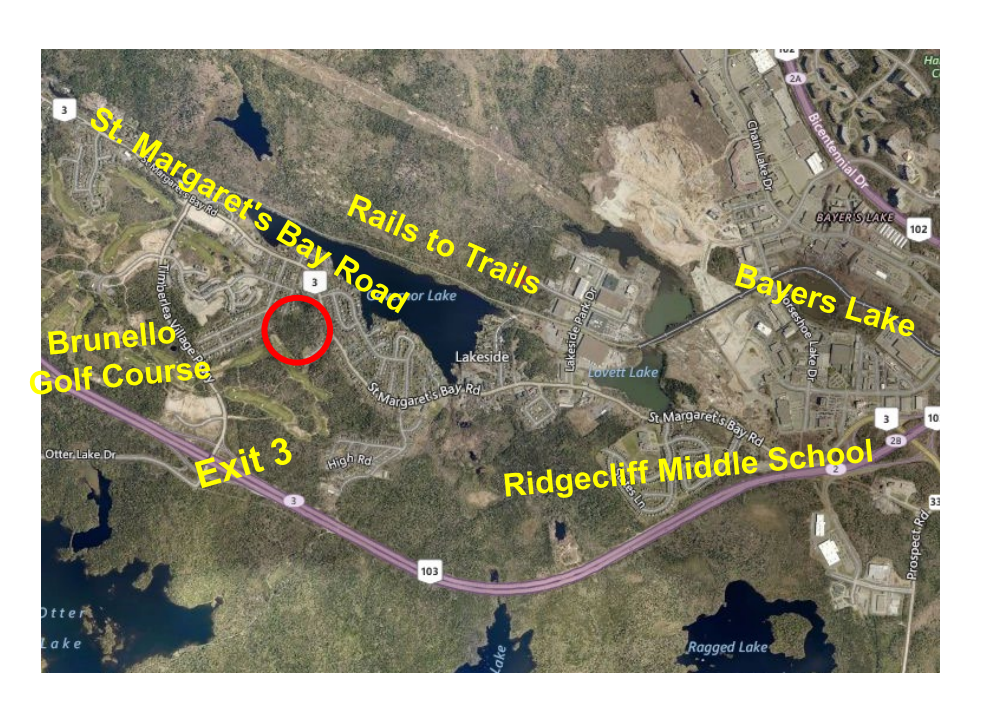
General Site location in Red