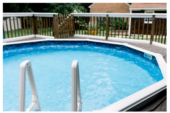
An above-ground pool, with a deck and fencing

Halifax Regional Municipality's Lot Grading Bylaw (L-400) was updated in 2020 to require a Lot Grading Permit for some pools and accessory buildings. A Lot Grading Permit applies to residential properties in the urban service area only. This means if your home is not serviced by the municipal sewer system, you do not apply for a Lot Grading Permit.