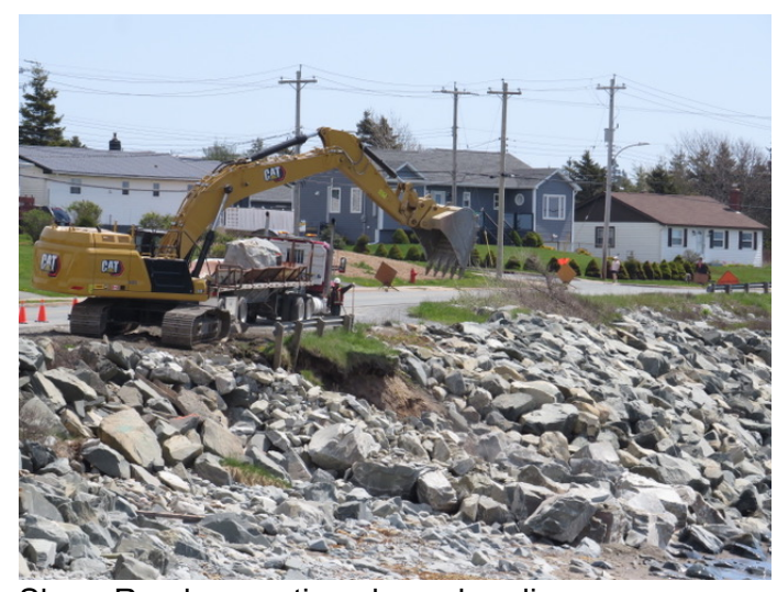
Shore Road reparation along shoreline.

The five key areas of the Accessibility Act -Built Environment, Employment, Public Transportation and Infrastructure, Information & Communication, and Goods & Services.