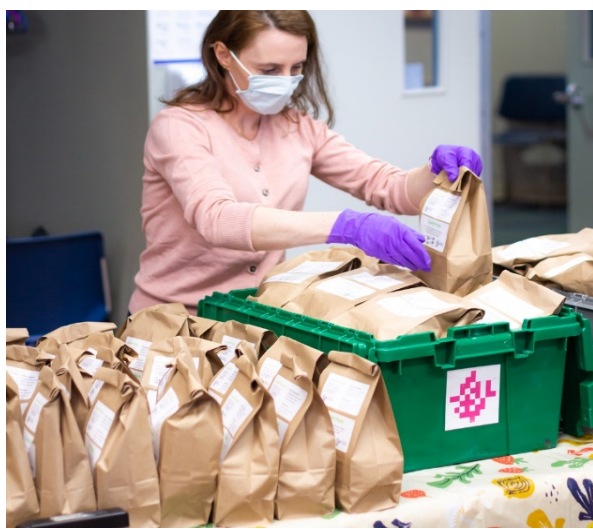
To-go bags being prepared at Alderney Gate Public Library for Curbside Pick-up across the municipality.