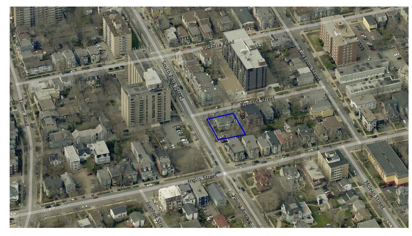
View of subject property facing North. Front of building is facing South Park Street.