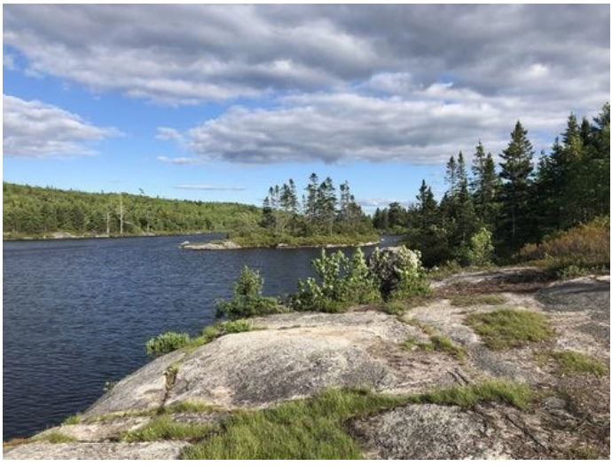
Govenors Lake, Timberlea, NS

HRM is renowned for its beautiful lakes. Though some lakes remain in good condition, there are others that are starting to show signs of stress from surrounding land uses such as development, lawn and road management, historical contamination, and overall climate change.