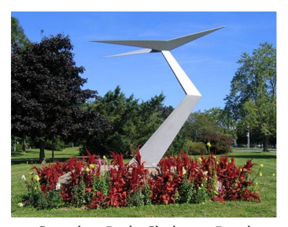
Saunders Park, Chebucto Road