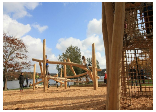
Sir Sandford Fleming Park (The Dingle)