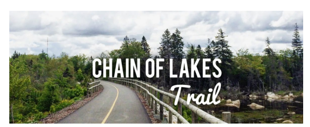
Chain of Lakes Trail