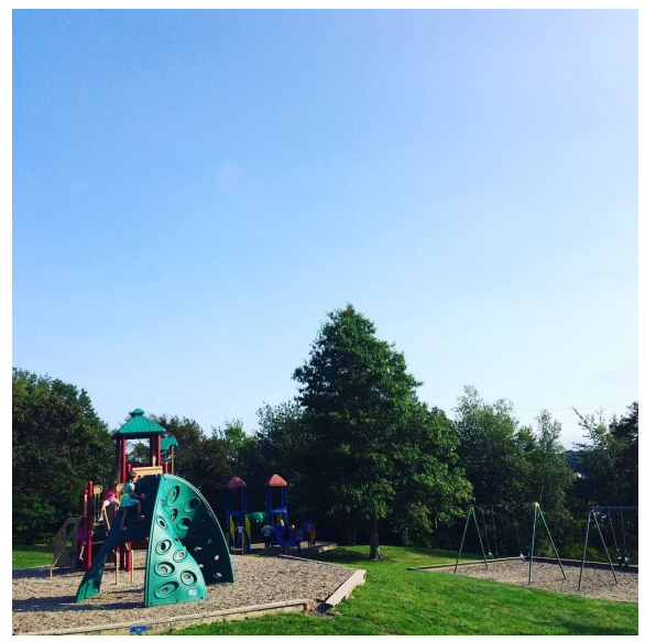
Flinn Park, Flinn Street