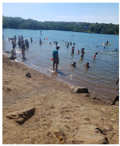
Chocolate Lake Beach