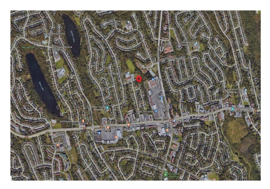
General Site location in Red