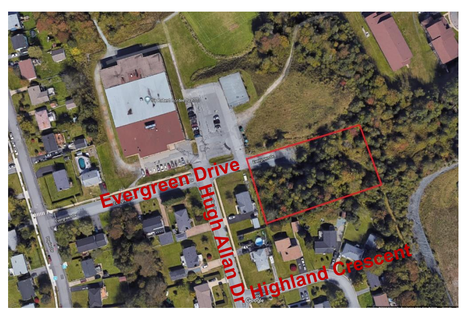
Site Boundaries in Red