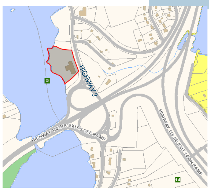
Site Boundaries in Red