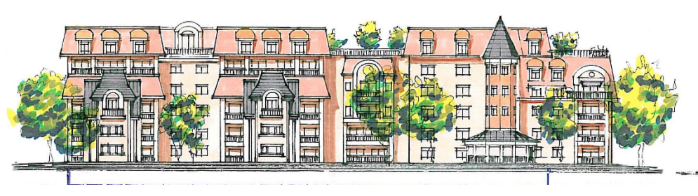
West Elevation (View from Lake Thomas)